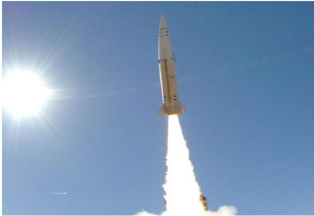
An ATACMS rocket.