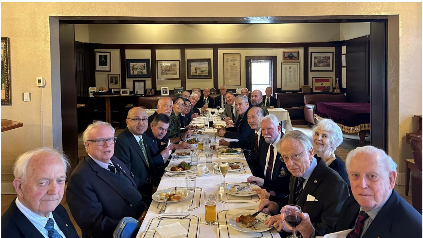
All the happy diners enjoying a great meal.