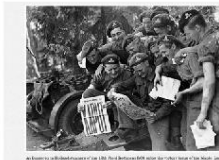
An American in the back of a tank of the 101st Airborne Division after the victory in the Netherlands, 1945