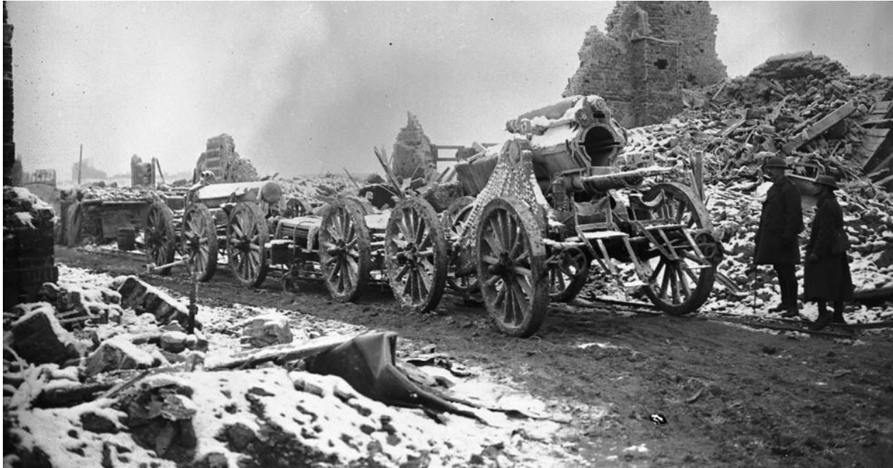
9.2-inch Howitzer mounted in pieces on wagons near Lens, France, Feb 1918.

At 10 a.m. Feb 4th advance party of 3 Officers and 10 Other Ranks proceeded to Lievan to take over Battery from 1st Canadian Siege Battery, who in turn relieved a Battery of the 91st H.A.C. then proceeding to Camp for training. The remainder of the Battery left Camp at 3 p.m. by Light Line Railway, reaching Lieven by 5 p.m. The Battery was then split into 3 sections Two Guns forming a silent section at Angres (M33a 18.44) and M33c 18.78. two other guns were placed in Cite Calonne at M14d 00.07 and