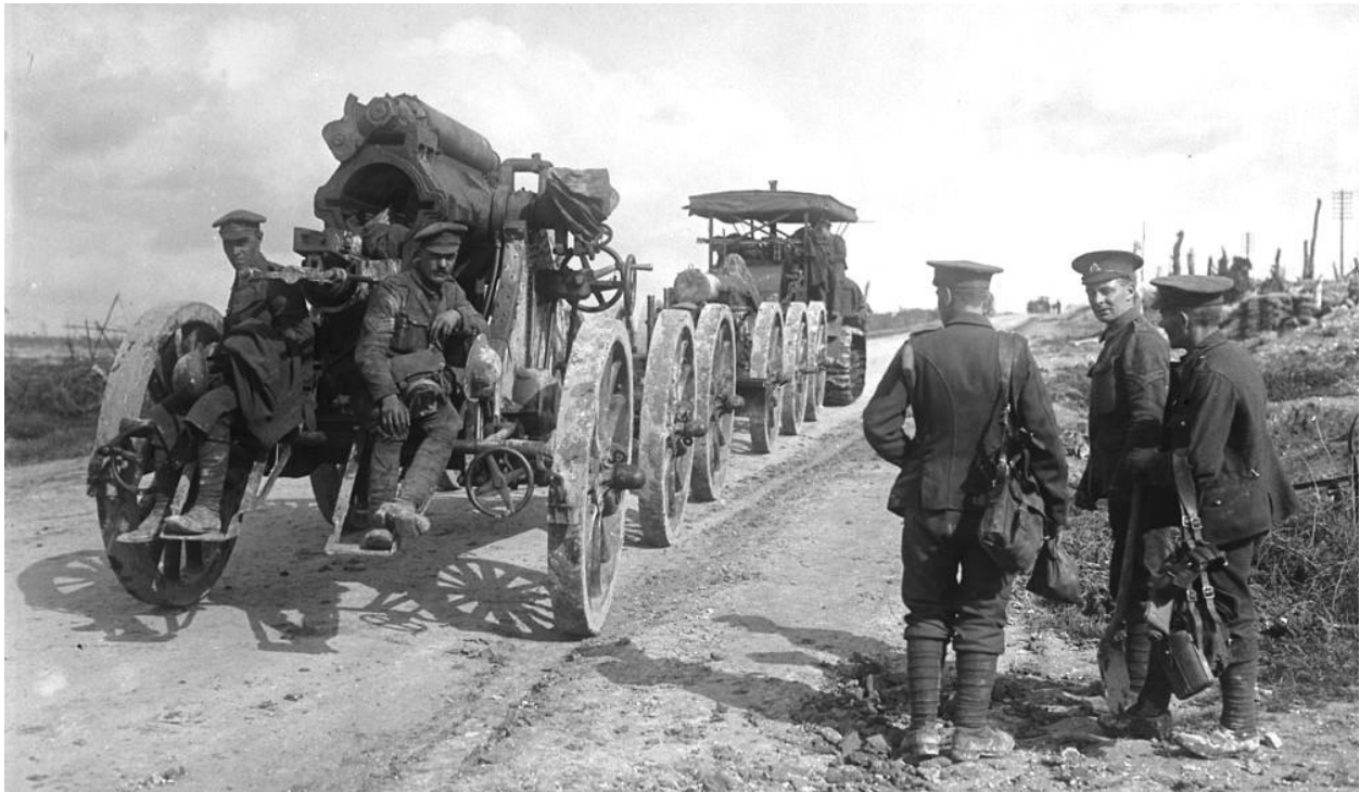
Heavy guns being moved forward in France, Oct 1916.

During the afternoon we fired at intervals on BELOW TRENCH front and support lines and also on GALOWITZ TRENCH front and support lines.