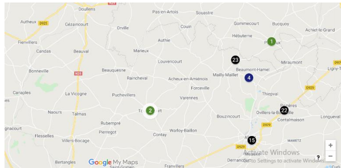
1- Pozieres 2- Toutencourt, 4 – Beaumont Hamel Monument, 15 - Albert Communal Cemetery Extension, 22-Pozieres British Cemetery, 23 - Sucrerie Military Cemetery

Dec 23rd - We were all ready to open fire today but weather was too bad to observe. Heavy rains and high winds increasing at times to gale force prevented any work being done. "B" Gun was however put into position during the night.