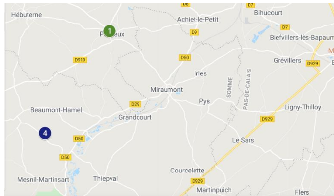
1- Battery location Pozieres / 4 – Beaumont Hamel Monument

Oct 22nd - At 8.30AM. we fired 25 rounds with aeroplane observation on Target 420 (Hostile Battery) the results were very good. 2 OK's being registered. After getting good registration the plane gave C.I. and we fired a further 75 Rounds on the Battery without observation. 436 Rounds were fired during the day on PYS, IRLES and MIRAMONT.