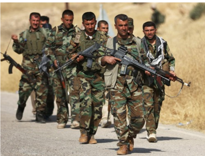
Iraqi Kurdish Peshmerga fighters march near Mosul in October 2016.