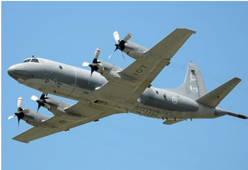
Lockheed CP-140 Aurora, RCAF