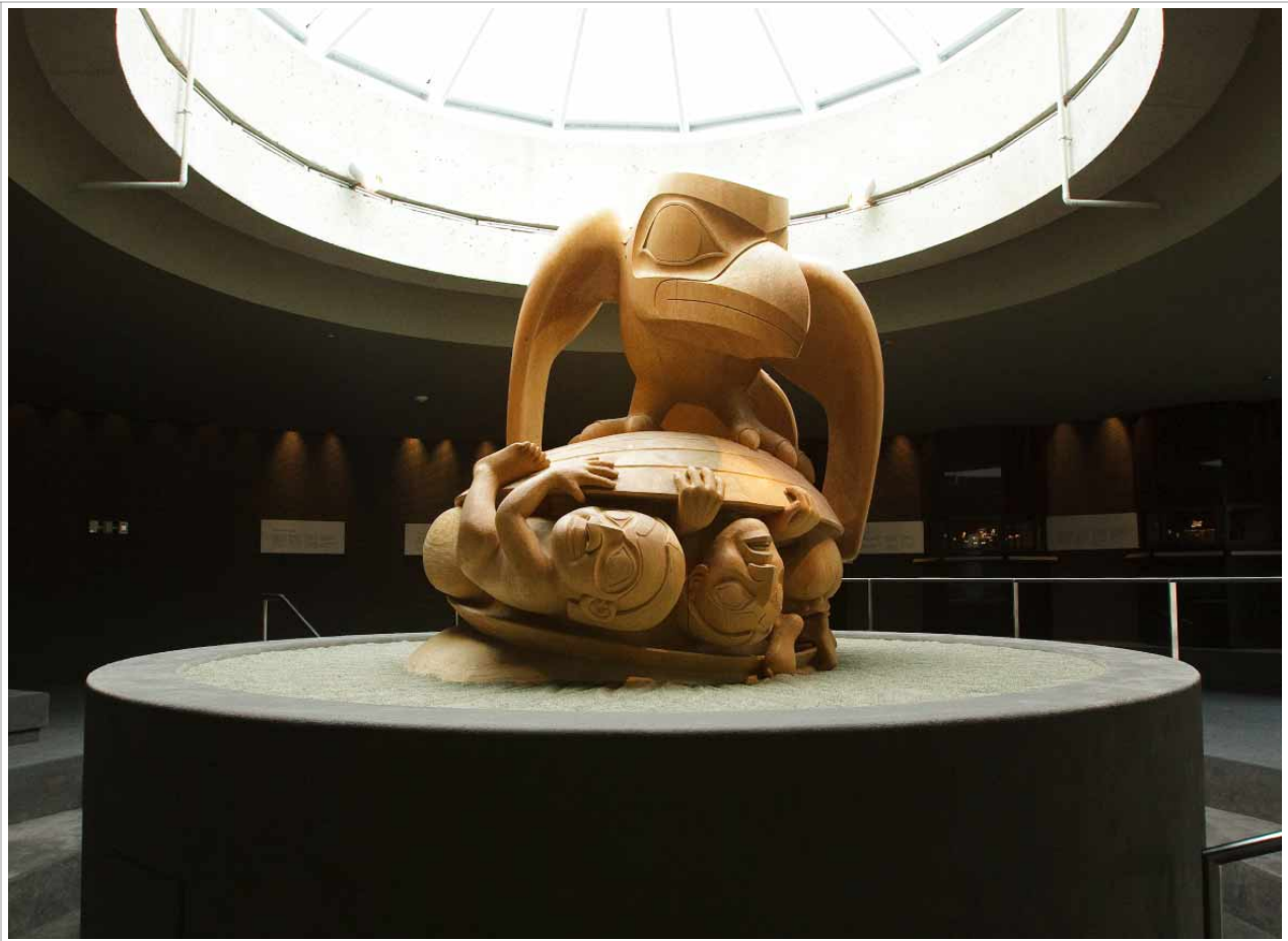
Bill Reid's The Raven and the First Men (1980; MOA Collection: Nb1.481) installed where a MK7 gun was once positioned during the Second World War.