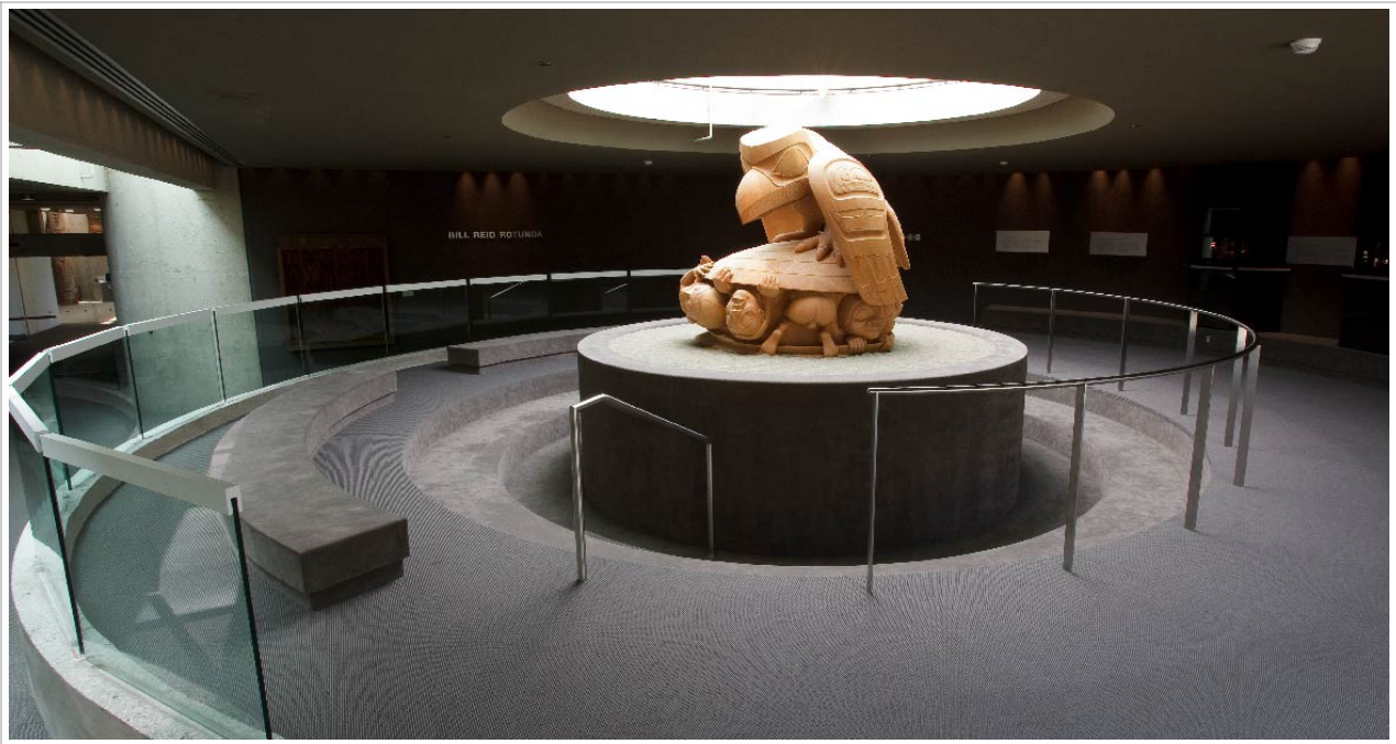
Bill Reid's The Raven and the First Men (1980; MOA Collection: Nb1.481) installed where a MK7 gun was once positioned during the Second World War.

Outside, on MOA's grounds — the same lands where the Musqueam people, and then soldiers of First and Second World Wars, once took their post — visitors can still see the exteriors of gun emplacements number one and three, flanking either side of the museum.