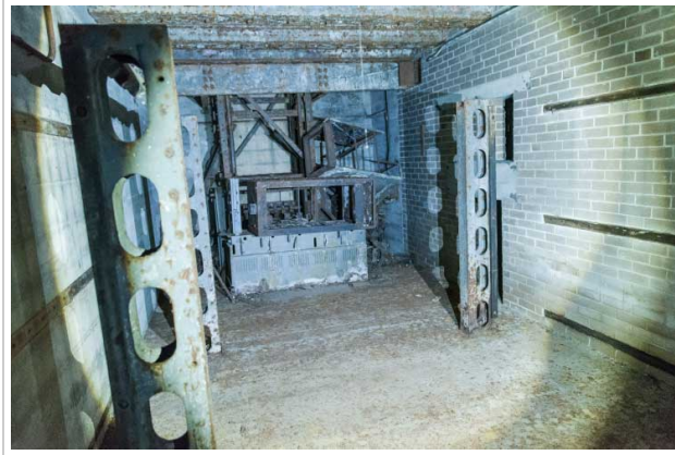
Interior view of the underground magazine and ammunition hoist located below each gun emplacement.

Two decades later, war was declared against Nazi Germany. A more extensive army facility was built here to defend BC’s coastline from Japanese naval attack. Positioned in a 100-metre line along the hillside, three circular gun emplacements, with underground magazines and ammunition hoists, were built with reinforced concrete. MK7 guns were placed on top of the emplacements, and a subterranean tunnel system connected each of them.