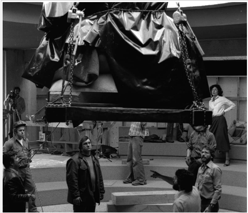
Bill Reid's The Raven and the First Men is lowered through the skylight for installation on what was once gun emplacement number two.

He would integrate one of the circular gun emplacements directly into the middle of the museum to serve as the site for Bill Reid's monumental work, The Raven and the First Men (1980). As Erickson recounted in 1999, "I suggested to Bill that he plan his work for the gun mount itself, and I would provide a round skylight over it, so that natural light would flood it — like the light of the forest."