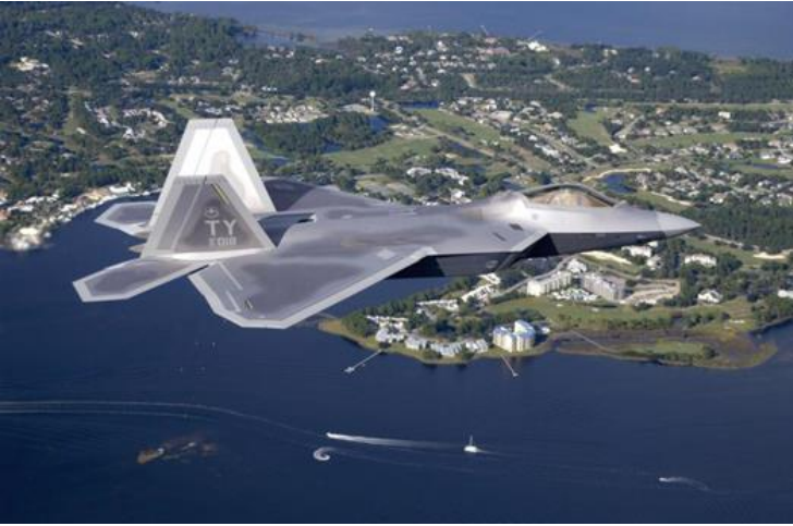
F-22 from Tyndall Air Force Base, Florida, cruising over the Florida Panhandle

off pursuit after two American planes escorting the drone broadcast a warning message. It was a close call. The March 2013 episode happened only a few months after a two Sukhoi Su-25 attack planes operated by the Pasdaran (the informal name of the Iranian Revolutionary Guards) attempted to shoot down an American MQ-1 flying a routine surveillance flight in international airspace some 16 miles off Iran.