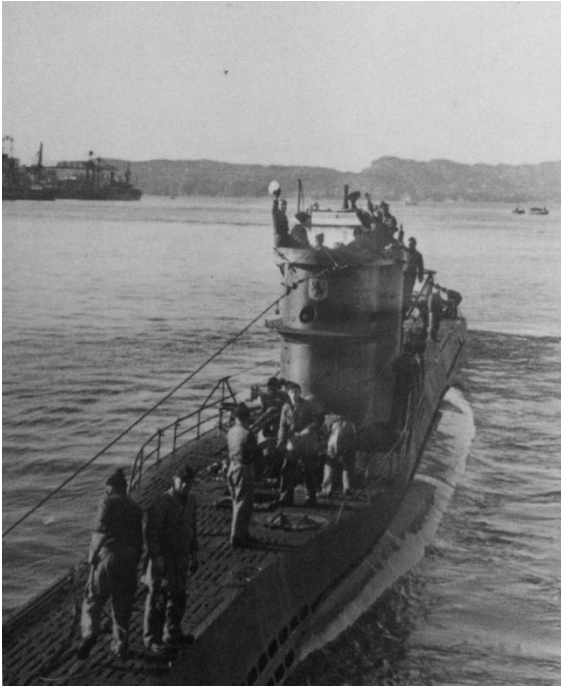
The crew on the deck of U-576.

departing the massive concrete U-boat pens at St Nazaire, France, on June 16, 1942. It was his fifth patrol in a year-old boat. But he had bagged only three ships and was plagued with engine problems. He had destroyed the armed British freighter Empire Spring , off Nova Scotia, killing all 55 hands aboard in February, 1942, according to the website Uboat.net. On April 30, 1942, he hit the Norwegian vessel, Taborfjell , with two torpedoes off Cape Cod. It went down in about a minute. Only three of its 20-man crew survived. But nine days earlier, when he torpedoed the American freighter Pipestone County off Norfolk, Virginia, he surfaced near the lifeboats. He gave the survivors provisions and apologized for sinking the ship. There were no fatalities.