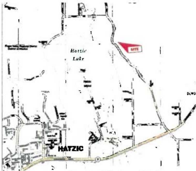
Lougheed Highway (No. 7)

The monument is located at "Shiloh Hill" at 9660 Sylvester Road. Travel 11 kilometers east of Mission City. Turn left on Sylvester Road (Husky gas station on corner). Travel 3 kilometers north. Enter at second gate.