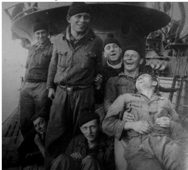
Crew members of U-576 pose for lighthearted photo.

have submerged to the bottom intentionally to play possum, and then couldn't surface again; or it might have had some mechanical problem or unseen damage. It could still have been structurally sound at that depth, Hoyt said. "It was completely within its operation depth range," which was about 750 feet, he said. But there's no indication that the crew got out. "There's only a few points of egress in and out of the sub," he said. U-boats did have some escape apparatus. "We could see pretty ... clearly that all of the hatches were sealed. So we knew at that point that the entire crew was still on-board."