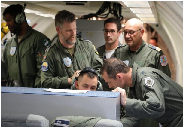
Inside an Airborne Warning and Control System (AWACS) aircraft, NATO personnel peer at a classified radar screen showing Russian positions across Ukraine. CBC News was granted rare access on board one of the 14 planes in NATO's Germany-based fleet in mid-October 2022.

As Ukraine takes back territory in its fight with the invading Russians, it is clear western intelligence has been a key component to their success, including the big picture offered by the AWACS. Commanders did acknowledge the unclassified capabilities of the system, which can "see" at least 400 kilometres beyond the aircraft, tracking Russian warplanes as they approach Ukrainian airspace, navy ships positioning for attack, and Russia's larger drones. Even, in some circumstances, the movements of tanks and other military vehicles. The AWACS aircraft can determine the paths of missiles, as well as aircraft, says professor Walter Dorn of the Royal Military College of Canada. "In fact, its resolution is such that it can track flocks of geese." "In Crimea now, we see a lot of activity," said Sgt Joao, acknowledging the efforts by Russia to push back a surging Ukrainian counter-offensive in the south.