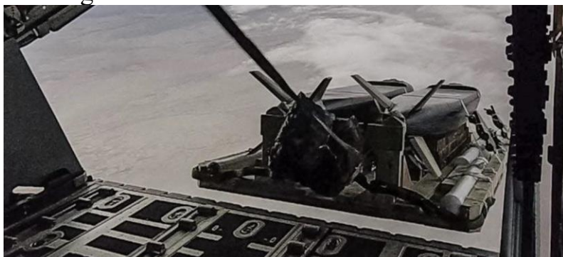
A pallet carrying CLEAVER deployed from MC-130J Aircraft.