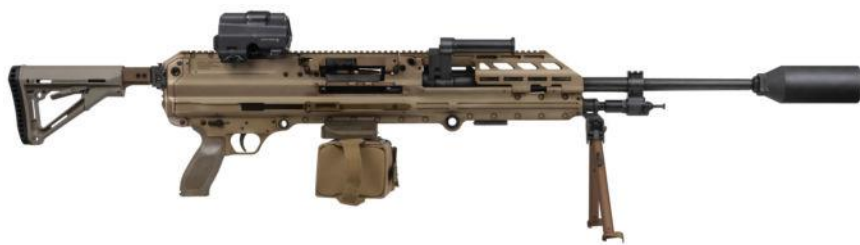
The SIG SAUER MG 338, a potential replacement for the M240. With the.338 Norma Magnum round it'll provide a level of firepower between the M240 and the M2 Browning machine gun.