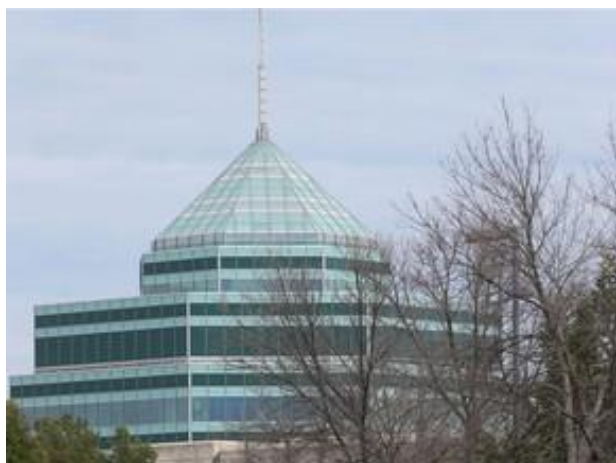
DND's Carling campus