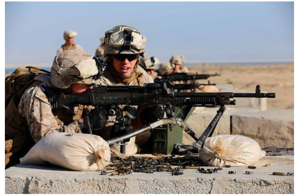
The classic 7.62 M240.