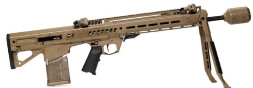
General Dynamics' RM277 NGSW-AR and NGSW-R prototypes.

Before a decision of this scope and breadth can be made – after all, it will mean outfitting thousands and thousands of soldiers with new weapons, which will cost millions of dollars – the American military is studying several factors that must contribute to its choice at Fort Benning in Georgia. The study is called a Platoon Arms and Ammunition Configuration (PAAC) study, and its results will help inform decisions about weapons made in the coming years. For the moment, the Army is not thinking of acquiring new machine guns equipped with advanced technology, but officials know that, at some point, that will have to happen. Presumably the study, which will conclude sometime in 2024, will examine how soldiers adapt to new guns and how changes in weight, size and other features affect their ability to use the weapons in a combat zone. Prototypes from three companies are under scrutiny at SOCOM: Textron Systems; Sig Sauer Inc, and General Dynamics Ordnance and Tactical Systems Inc.