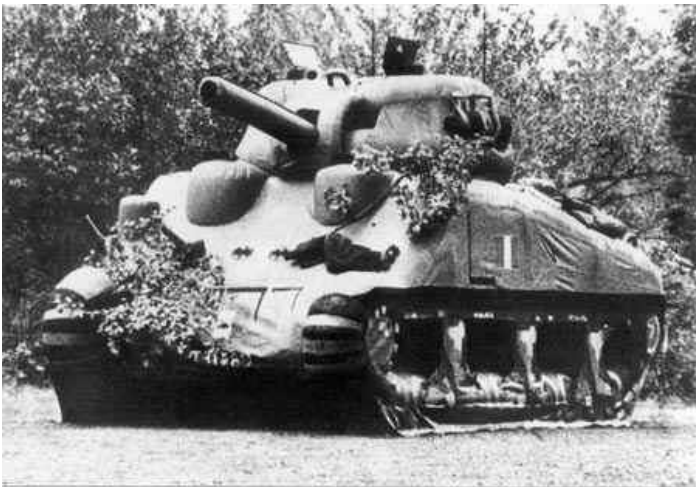
An inflatable dummy Sherman tank, one of Maskelyne's many claimed inventions although no proof exists for this particular claim.

According to Maskelyne's book— Magic: Top Secret —'A' Force and Maskelyne were responsible for a number of extravagant deceptions. One of the first feats was getting a sunshield devised by Wavell to work. The sunshield was made by stretching painted canvas over half a tank to disguise it. A British reconnaissance pilot was sent to fly over the covered tanks and was unable to spot them. A 'sunshield' covering half a Matilda II tank at a workshop of the Middle East Command Camouflage Development and Training Centre, Helwan, Egypt in 1941, as used in Operation Bertram . One of the biggest deceptions carried out by 'A' Force was during the protection of the city of Alexandria. 'A' force was assigned to conceal the harbor, but it was deemed as too large and had too many ships to be hidden. An alternative solution was devised, with Maskelyne tasked with constructing a fake city of Alexandria. A decoy harbor was built at Maryut Bay using cardboard and mud. Lights were placed in the fake harbor along with explosives. When the Luftwaffe flew to attack, Maskelyne blew up some of the fake buildings and ships in his fake harbor. This led the pilots to believe that they had successfully dropped their bombs on the city, leaving the real Alexandria left intact.