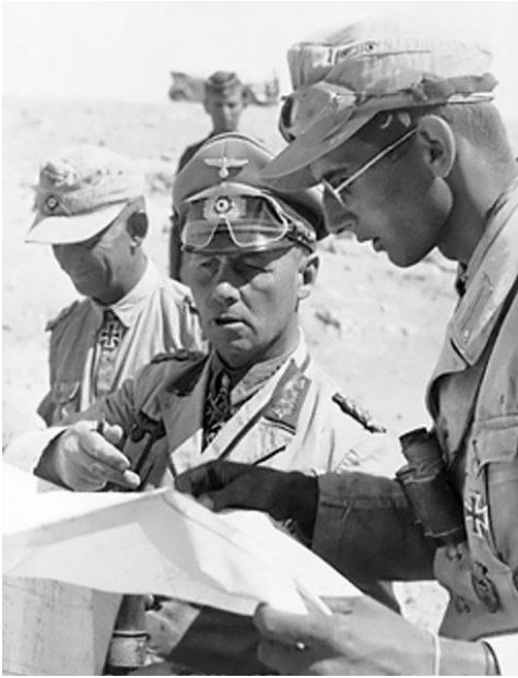
Field Marshal Erwin Rommel with his aides during the desert campaign, 1942.