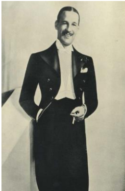
John Nevil Maskelyne 1839-1917, English stage-illusionist and inventor.