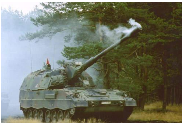
The PzH 2000 during firing trials in Germany using Denel Assegai shells

The PzH 2000 (Panzerhaubitze 2000) is the 155mm self-propelled howitzer developed by Krauss-Maffei Wegmann (KMW) together with the main subcontractor Rheinmetall Landsysteme for the German Army. KMW received a contract in 1996 for production of 185 units. The first system was delivered in July 1998 and deliveries for this batch are complete. Rheinmetall (formerly MaK) delivers the complete chassis for all series vehicles. In May 2001, during test firings for the Hellenic Army, the PzH 2000 fired 20 rounds all to ranges exceeding 40km (41.8km