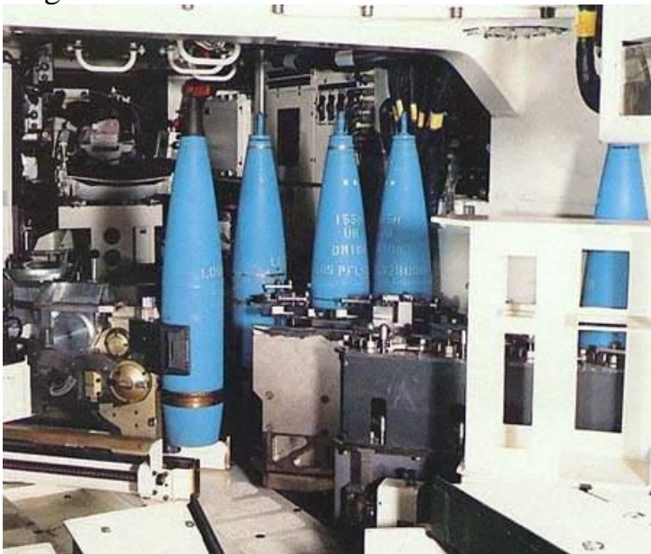
The PzH 2000 magazine compartment with the feed mechanism.

In September 2006, the PZH 2000 completed its first live-fire combat mission with the Dutch Army in Afghanistan, as part of Operation Medusa. In operations against the Taliban, three PZH 2000 provided fire support at a range of more than 30km. The electrical gun control system, supplied by ESW Extel Systems Wedel, comprises the automatic elevating and traversing drives with semi-automatic back-up, direct laying with electrical instrument control and manual control. The 155mm L52 gun of the PzH 2000 was developed by Rheinmetall DeTec. The barrel length is 52 calibre and chamber volume is 23L. The gun has a chromium-plated barrel and semi-automatic lifting breech block with integrated 32-round standard primer magazine.