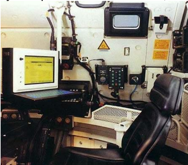
The PzH 2000 fire control computer provides full ballistics computation

system (MTLS), the DM72, which provides for faster handling, less wear on the gun, lower sensitivity to ignition hazards and improved range. In the PzH 2000, up to six MTLs modules form the propelling charge. The maximum range of the L52 gun using the maximum MTLs charges is 30km with the standard L15A2 round and up to 40km with assisted projectiles. The PzH 2000 automatic shell-loading system can handle 60 rounds of 155mm ammunition. The shells are picked up from the back of the vehicle and automatically stowed in the 60-round magazine in the centre of the chassis. The shell-loading system is driven by brushless electric servo motors supplied by MOOG. The automatic shell loading system has pneumatically driven flick rammer and automatic digital control, ammunition supply management and inductive fuze setting. This provides rates of fire of three rounds in under ten seconds and loading of 60 shells by two operators within 12 minutes, including the collation of ammunition data.