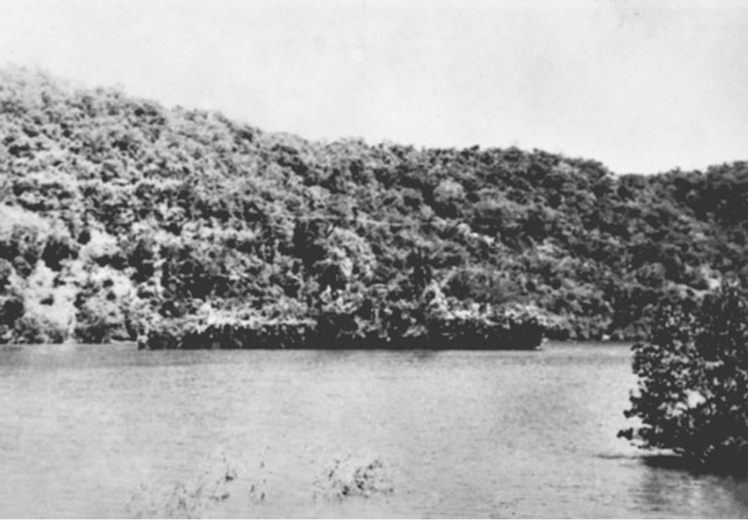
HNLMS Abraham Crijnsen blending with the environment. 1942.

In February 1942, in the midst of World War II, the Japanese fleet completely wrecked a combined Dutch-American-Australian-British fleet at the Battle of the Java Sea. This defeat led to