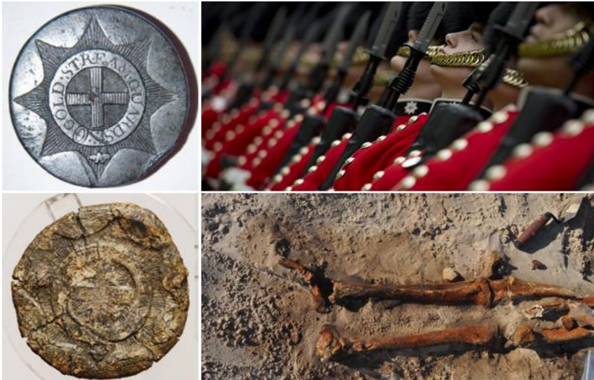
A preserved Coldstream Guards button.

The 200-year-old body of a British Coldstream Guards soldier was found in sand dunes in the Netherlands. Who was he?