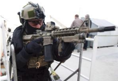
A member of Canadian Forces JTF2 special operations unit storms a ship during the training exercise Operation Nanook off the shores of Churchill, Man., in August 2012.

But the plan laid out in a military briefing note written for then chief of the defence staff. Gen Tom Lawson goes further. It suggests military officials from both countries were seeking to align some forces in a permanent and formal arrangement. A source familiar with the planning told CBC News the CAN-US IF, as it's called, would be scaled in proportion to the conflict it was being deployed to. Such a force could feature just ships, or ships and planes, or some combination of all military forces including ground troops and special operation soldiers.