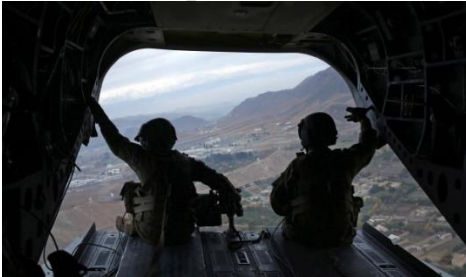
US Special Forces personnel sit in a military helicopter over Kabul, Afghanistan, in November 2014. CBC News has learned that the Canadian military has been working on a plan to create an integrated force with the US

American Aerospace Defence Command (NORAD), but would be used on expeditionary operations, and not in defence of the homeland, according to a source. The briefing note, released to CBC News under the Access to Information Act, was written in October 2013. It contemplates how the military could remain globally engaged as Afghan training mission was coming to a close. Canada and the US have for long partnered together on military operations, including in the war against ISIS and in Afghanistan. Both countries would continue to operate their own separate militaries, which would contribute units based on need.