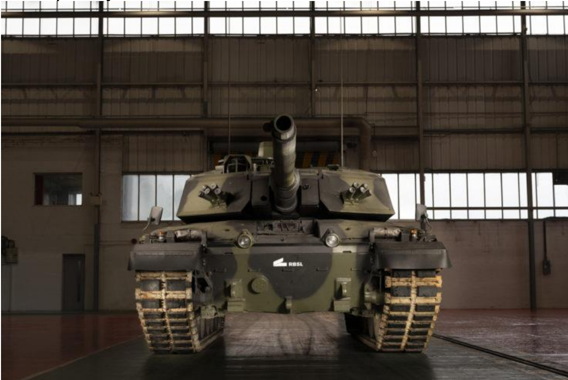
Challenger 3 Main Battle Tank.

However, it has been showing its age in recent years, resulting in a number of proposed upgrades. It has received much criticism for its rifled gun. The first improvements were discussed in 2005, with the Capability And Sustainment Program (CSP), however, it would not be until 2014 that this was taken seriously. By that point, the upgrade program was called the Challenger 2 Life Extension Program (LEP). From the LEP came two prototypes: one from BAE Systems and another from Rheinmetall. In 2019 BAE Systems and Rheinmetall merged their British services into Rheinmetall BAE Systems Land (RBSL) and combined their efforts into a design with a completely new turret, placed on a slightly improved Challenger 2 hull. This would become the basis for Challenger 3. In May 2021 the MOD signed a $1.1 billion (£800 million) contract with RBSL to upgrade 148 Challenger 2s into the new Challenger 3 specification. The upgrades should be complete by 2030.