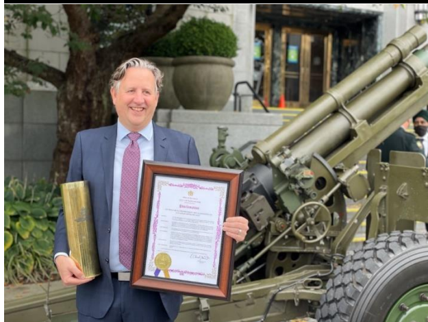
Mayor Kennedy Stewart, with the shell casing presented to him by the Regiment, shows the official proclamation naming Oct 2, 2021, '15 FIELD ARTILLERY REGIMENT ROYAL CANADIAN ARTILLERY DAY'.

15 Fd Artillery Regiment was granted the Freedom of the City of Vancouver in 1977. The Regiment had planned on exercising their rights under that grant during 2020, its Centennial year, but had to postpone because of the pandemic. They were finally able to