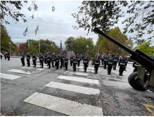
Regiment formed up for inspection.