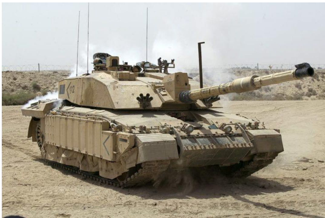
Soldiers of 1 A Squadron, Queens Royal Lancers (QRL) patrolling outside Basra, Iraq onboard a Challenger 2 Main Battle Tank during Operation Telic 4.