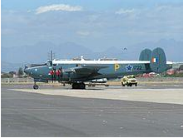
An Avro Shackleton at the South African Air Force Museum - note the contra-rotating propellers, tricycle undercarriage and nose armament