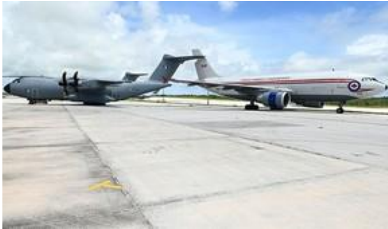
The end result of a Canadian CC -150 Polaris that rolled away and collided with a parked French Air Force A400M on July 22, 2023 at Anderson Air Force Base in Guam. The Canadian aircraft will be scrapped.

An RCAF crew assigned to fly the plane back to CFB Trenton arrived at Hickam Air Force Base in Hawaii on July 21, the report read, with plans to depart Guam the next day for Canada. “The aircraft was loaded with equipment and baggage in preparation for departure the following day,” the report read. Noting the plane was left “partially secured” without wheel chocks, the report said 15003 rolled backwards on its own at 10:30 a.m. the next morning, colliding with a French Air Force Airbus A400M parked nearby. “Following contact the CC-150 rebounded forward, coming to rest approximately eight meters from the point of impact,” the report read.