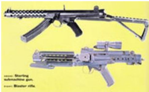
An E-11 pictured with a Sterling submachine gun from which it was designed

Last Week: So, what connects the Star Wars Storm Troopers to the Canadian Army? It's the E11 Blasters they carry. The E-11 blaster rifle props used in A New Hope and The Empire Strikes Back were built from a British-made Sterling Mark 4 L2A3 sub-machine gun. The Sterlings used in both productions were provided by British film armourers Bapty & Co. For the filming of Return of the Jedi , ILM used Sterling copies manufactured by MGC (Model Gun Corporation). The scopes used on E-11 props were World War II tank scopes, most notably the M-38 (but also M40 and M19), used in A New Hope .