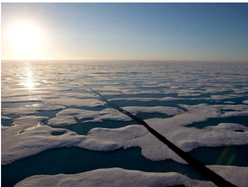
The midnight sun shines over the ice covered waters near Resolute Bay as seen from the Canadian Coast Guard icebreaker Louis S. St-Laurent, Saturday, July 12, 2008.