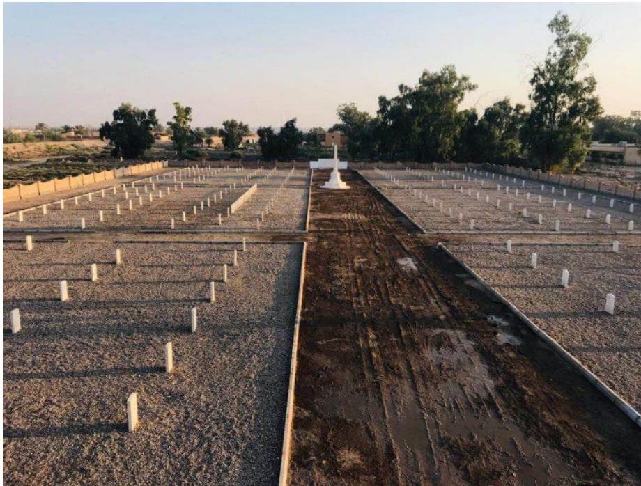
The war graves commission has installed 300 new headstones at Habbaniya War Cemetery in Iraq.

The war graves commission has made some progress in Iraq. During a gap in hostilities in 2012, it renovated Kut War Cemetery. In 2019, it renovated the cemetery on the former RAF base in Habbaniya, now occupied by the Iraqi army, and installed nearly 300 new headstones. "The commission