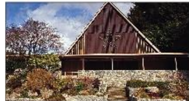
St. Catherine's Anglican Church Phone: (604) 985-0666