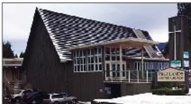
Highlands United Church Phone: (604) 980-6071