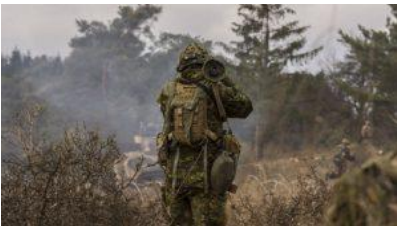
A Canadian Armed Forces member takes aim with a Multiple Integrated Laser Emanating Systems simulated rocket launcher while conducting a simulated attack during Exercise ALLIED SPIRIT IV in January 2016. Canadian Army researchers are investigating the potential of more powerful laser devices that may be effective tools against improvised explosive devices and other threats.