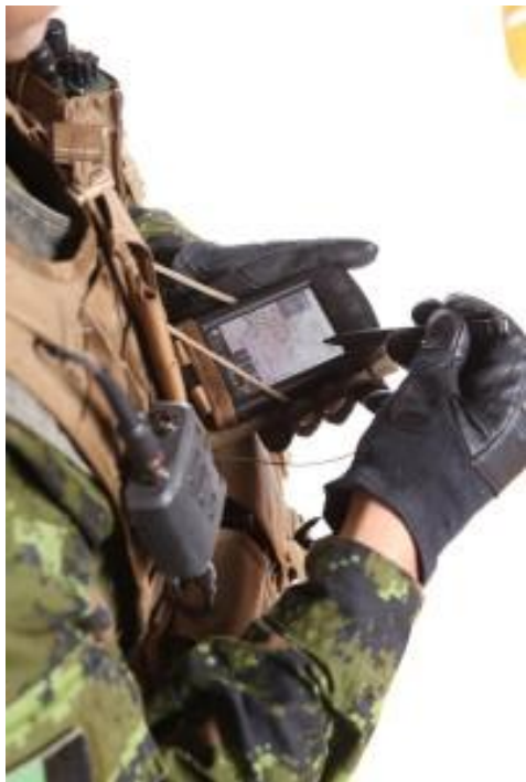
ISS Argus Rheinmetall ISS

The first iteration of Nett Warrior was introduced at the Network Integration Evaluation 11.2 assessment in spring 2011. By mid-2012, the Nett Warrior had morphed from a 10-lb Ground Soldier System to one that is based on an “end user device,” essentially an Android or iPhone-like smartphone tied to the Rifleman handheld radio. The device links to command and control networks and uses applications to call in fire support, plan and coordinate operations, and track friendly forces. In 2013, the US Army installed the Samsung Galaxy Note II into Nett Warrior as the system’s end user device. The US Army’s 2016 budget includes funding to field Nett Warrior in three brigade combat teams, increasing information and situational awareness for dismounted platoon, squad, and team leaders. During the exercise, two sections from 38 Canadian Brigade Group and a section from the New Zealand Army formed a platoon embedded into a US company. The troops conducted missions against a near peer enemy force also wearing the same technology.