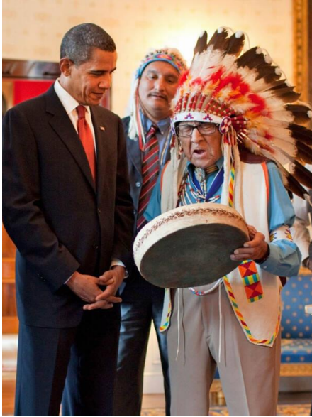
President Barack Obama and Joe Medicine Crow in 2009.

Joe Medicine Crow became a war chief for the Crow. He also earned a Bronze Star and the French Legion of Honor for his service.