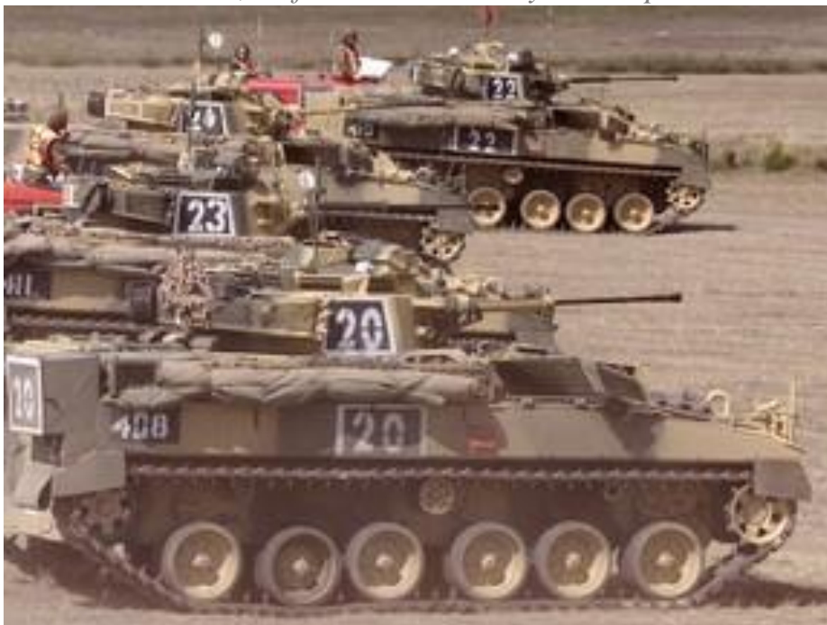
Armoured vehicles are shown during an exercise at CFB Suffield in 2001.

Dominic Nicholls, Defence and Security Correspondent - The Telegraph -23 November 2021