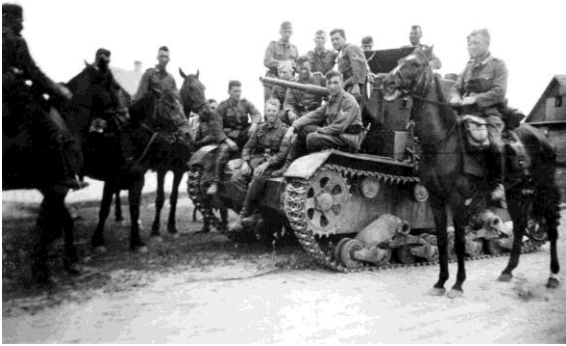
German cavalry with a seized Soviet tank in 1944.

ammunition back to his company. Joe Medicine Crow took on the challenge and successfully led seven men in the mission, saving the company. At that point, Joe had completed three of the steps to become a war chief. But how was he going to steal horses from the Nazis? Horses and modern warfare seem incompatible. The rules for becoming a Plains war chief had been created for a different type of battle than American troops faced on the front lines of World War II. But even modern armies relied on horses to transport artillery and in cavalry units. And although the Nazi army was famously mechanized, some companies still relied on horses because of their limited access to oil.