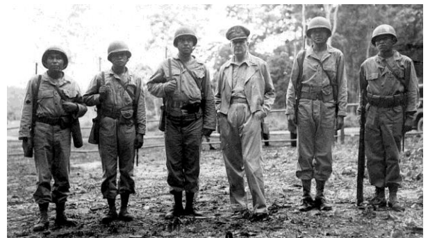
US Army General MacArthur standing with Native American troops. A total of 25,000 Native American soldiers fought in World War II.

During a raid in a small French town, Joe found himself alone in an alley with a German soldier. Medicine Crow used his rifle to knock the German's gun to the ground, thus taking a weapon from an enemy. He was also able to take the German as a prisoner of war, touching a living enemy. As an infantry soldier, Joe rarely led missions. But during a dangerous moment when German soldiers surrounded Joe's company, his commanding officer put Joe in charge. He had to brave land mines, enemy fire, and overwhelming numbers of enemy soldiers to bring