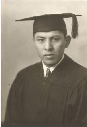
Joseph Medicine Crow. Joe Medicine Crow was the first member of his tribe to earn a master's degree, and left his PhD program to volunteer for service in World War II.

Indigenous way of life on the Great Plains. The feat required passing four tests, including touching a living enemy, stealing an enemy's weapon, and successfully leading a war party. Finally, a person had to sneak into an enemy camp to steal a horse. Generations of men passed this test and became war chiefs. But the last feat became all but impossible as Native Americans were forced onto reservations and horses slowly disappeared from the battlefield in the 20 th century. And yet Joe Medicine Crow managed to accomplish all four tasks almost by accident, and in a place few members of the Crow Nation had ever visited. He earned the honor fighting Nazis in Germany with the US Army. He was born on the Crow Reservation in Montana in 1913, and learned the traditions of the Crow Nation from an early age. His grandfather, White Man Runs Him, had been a scout for General Custer prior to the Battle of Little Bighorn. His other grandfather, Chief Medicine Crow, was a revered war hero.