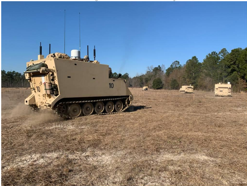
US Army soldiers assigned to the "Can Do Battalion" test and provide feedback on network equipment during a three-week pilot at Fort Stewart, Georgia, in February 2022.