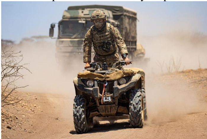
A soldier from 2 Rifles mortar platoon rides a quad bike on Exercise Askari Storm, Kenya.

Security is a principle of war, yet we are quick to let our guard down, sometimes with devastating consequences. In one exercise we lost 50% of a company to indirect fire after they remained in the same position, despite knowing that the enemy had identified them several hours beforehand. Why is this? Fatigue sets in and encourages us to lower our standards and take the easy route. We must keep our guard up. The enemy will come for us when we least expect it. If you're not ready you will die. On another occasion, 70% of a company was destroyed mounting its vehicles in an area they had failed to secure. This is a failure in the basics! Get your sentries out and keep them out. Secure your perimeter. Losses of this scale can never be tolerated.