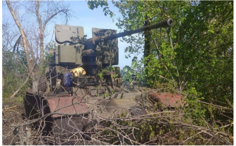
A 57 mm S-60 cannon 1950 model on the chassis of the T-55 tank in Russian service somewhere in Ukraine.

This isn't that uncommon. Mounting weapons on vehicles not generally designed for them is a tried-and-true tactic in war. It's been done across Europe, Africa and the Middle East, from the Great Toyota War of the 1980s between Chad and Libya to a Libyan militia that more recently fitted a massive 90mm cannon onto a Humvee. If the vehicle can handle the weight and recoil of each weapon, it can be effective on the battlefield. And these relatively low-tech solutions, combined with some older weapons like World War I-era Maxim machine guns, have still proven to be effective in the war in Ukraine. Despite the many setbacks and museum pieces being brought out of storage, Russia so far has been able to keep up its positions in eastern and southern Ukraine. A report by the British think tank, the Royal United Services Institute, looked at Russian tactics in the second year of the war and noted that it has adapted its use of armor, using it instead for fire support to supplement artillery that might be low on ammunition — a tactic also used by Ukrainian troops. It looks like that also includes some very customized vehicles.