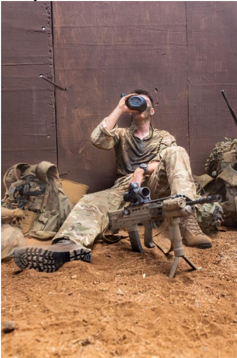
A soldier from 2 Rifles mortar platoon takes a drink after a live fire serial on Exercise Askari Storm Kenya.

We all know 'no plan survives contact with the enemy'. That said, we were lucky, often executing our plans. Having said that, on several occasions companies were thrown into the fight earlier or later than expected or given new tasks during the battle. Without a flexible mindset that quickly steps up to new challenges, you will lose the initiative you fought so hard to seize. Every commander, at every level, needs to anticipate being re-tasked continuously. Additionally, everyone must understand the commander's intent and the mission's main effort.