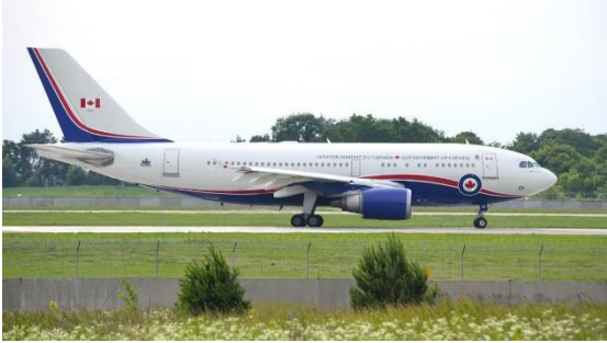
Can Force One in 2014