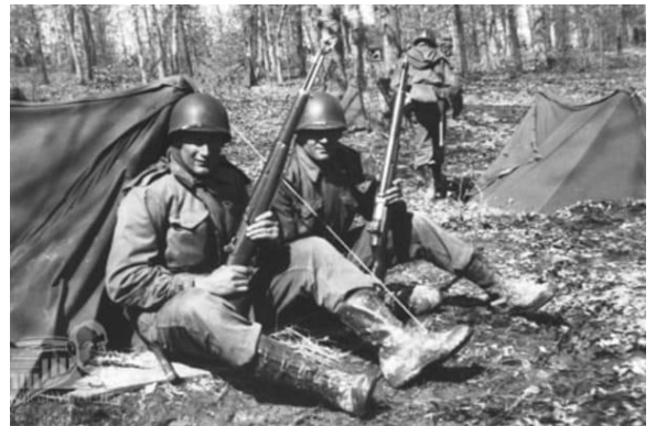
Vietnam War 1957 - 1975, American bivouac in the forest, South Vietnam

Today: Modern military leaders struggle to balance unit speed with soldier load. The addition of electronics and armour has greatly increased the burden on warfighters. In response, the modern pup tent has moved away from the bulkier shelter-half designs of the past. Today's modern dome Pup tents are extremely lightweight (usually under 5 lbs), more durable, fully waterproof, and incorporate the use of mosquito mesh netting. All these advancements give warfighters greater mobility and protection. The most popular military-issued Pup tent is the LiteFighter 1.