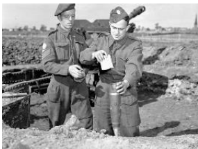
Photo by Lt Frank Dubervill, Canadian Army Film and Photo Unit (CAFPU), 1944.

Last Week: Private RJ Travis of No 3 Leaflet Unit placing propaganda leaflets into a shell to be fired by Sergeant T McCormick, the No 1 of the 25pdr, of the 191 st Hertfordshire and Essex Yeomanry Field Regiment, Royal Artillery, into German-held positions in Dunkirk, France, ca 15-25 September 1944. This Regiment supported the Canadian Army's 8 th Infantry Brigade in Normandy. The cap badges and sleeve insignia have been censored (obliterated) by the Canadian Army according to Security rules of the day.