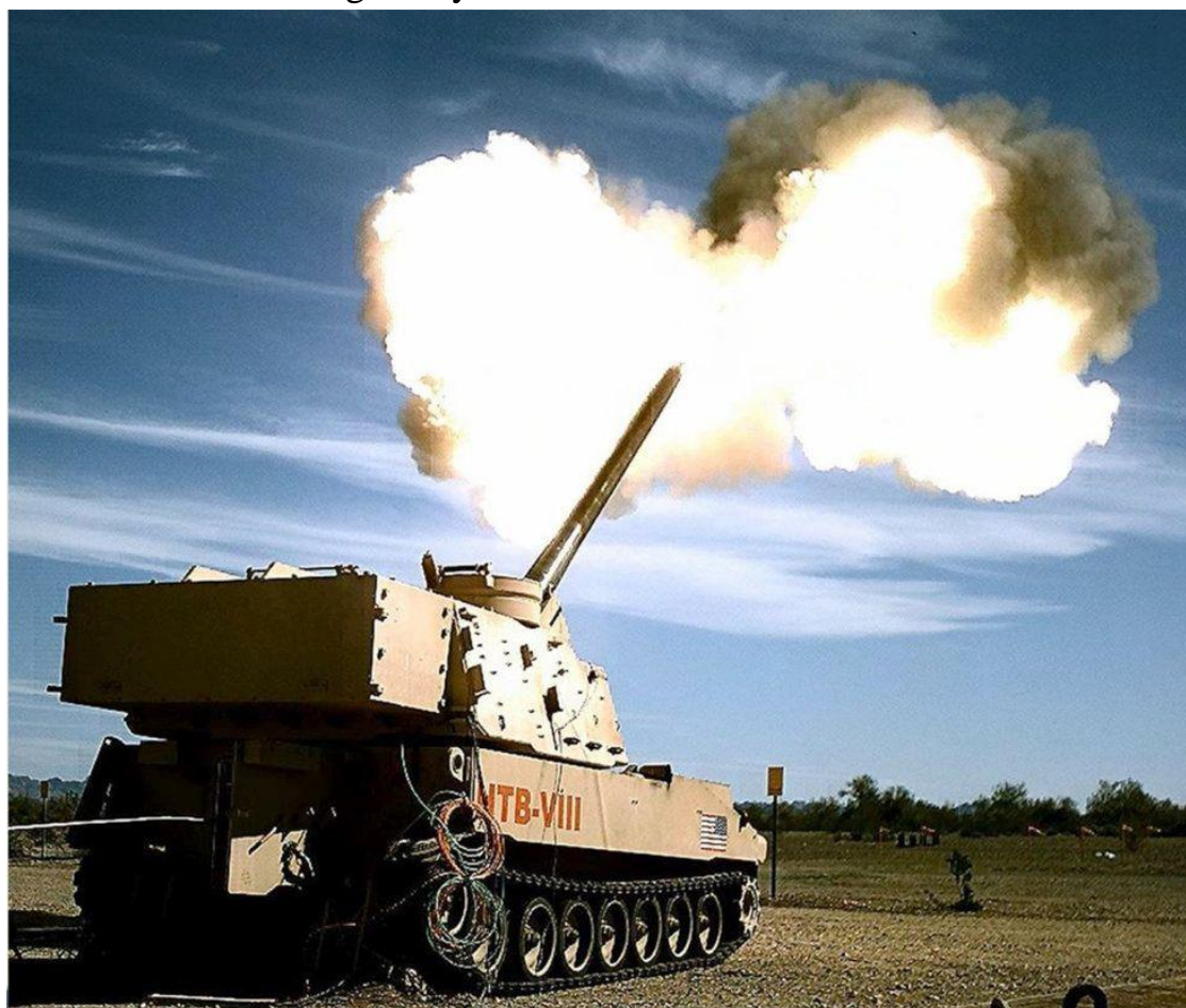
Extended Range Cannon Artillery, or ERCA, will be an improvement to the latest version of the Paladin self-propelled howitzer that provides indirect fires for the brigade combat team and division-level fight

The future of Army long-range precision officially has a name. The Army confirmed on Monday that it plans on designating the Extended Range Cannon Artillery (ERCA) program's brand new 155mm self-propelled howitzer as the M1299, Army Recognition reports. Developed in response to increasing concerns of near-peer adversaries like Russia and China, the ERCA gun nailed targets with pinpoint accuracy at a range of 62 kilometers during testing at the Yuma Proving Ground in Arizona in March, far outstripping the range of both the M109A7 Paladin (30km) and M777 (40km with the M982 Excalibur guided artillery shell) howitzers. Compared to those systems, the M1299 will receive two "leading-edge technologies," as Army Recognition reports: the experimental new XM1113 rocket-assisted artillery shell, and a longer 58 caliber tube and a larger chamber designed to boost the conventional howitzer range from 38km to 70km and, eventually, an eye-popping 100 km "within the forthcoming four years."