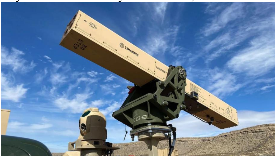
The Vampire, also known as Vehicle-Agnostic Modular Palletized ISR Rocket Equipment, will be sent to Ukraine as part of the Pentagon's latest aid package.

Russia, meanwhile, has looked to Iran to sustain its supply of drones, according to US officials. The Vampire is part of a larger package in aid to Ukraine, bringing the total amount supplied to the country during the Russia-Ukraine conflict to more than $13.5 billion since the start of the Biden administration. The Biden administration selected the Vampire — a low-cost and easy-to-assemble weapon compared to other counter-drone measures, such as electronic warfare technologies — for a package advertised as providing supplies for Ukraine’s long-term needs. “We’re trying to be very deliberate about what systems we think makes the most sense for Ukraine to have in that context, and it also matters very much: Can they sustain it? Can they afford it? Because of course billions of dollars of international assistance may not be something 10 years from now or 20 years from now,” Kahl said.