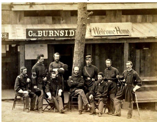
Burnside (seated in the middle) with the 1 st Rhode Island Brigade at Camp Sprague, Rhode Island in 1861.

These days soldiers can wear beards, with some restrictions – these sideburns would probably not be allowed today in the CF.