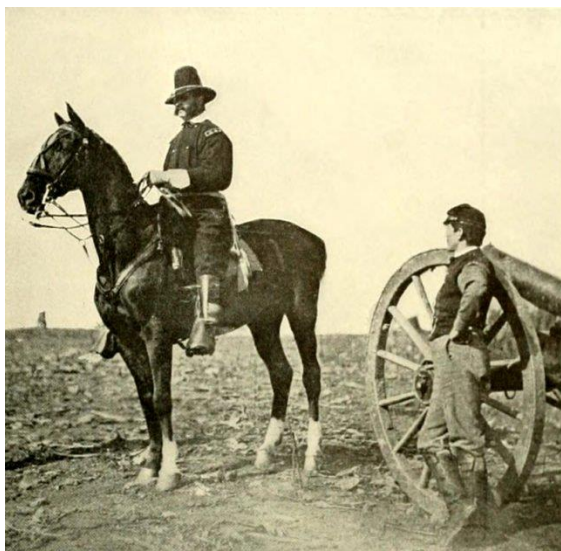
Union General Burnside (mounted) in 1862.

In 1858 he ran for a Congressional seat in Rhode Island. He lost by a landslide. Worse, a fire destroyed his factory. He then became the treasurer of the Illinois Central Railroad. It was while there he became close friends with George Brinton McClellan; the man who would become his commanding officer. In 1861, the American Civil War broke out. Burnside returned to the military as a Brigadier General in the Rhode Island Militia. It was he who created the 1 st Rhode Island Volunteer Infantry Regiment, becoming its Colonel and arms supplier. From there he moved on to command the Brigade of the Department of Northeast Virginia which saw action at the First Battle of Bull Run in July. Despite his shining bald head and impressive sideburns (a fashion named after him), they served with no distinction. By August 1861 he was training the new Army of the Potomac. From September until July 1862, he led the naval operation along the North Carolina seacoast. They blockaded some 80% of Confederate shipping until the end of the war. It was also he who led the successful Burnside Expedition which destroyed the Confederate fleet in 1862. His victories at Roanoke Island and New Bern were also among the first significant Union victories in the Eastern Theater. He was now a Major-General.