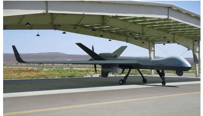
The MQ-9 with the REAP pod.

The US Army has also been experimenting with the ALTIUS 600 as part of its Air Launch Effects (ALE) effort, which also envisions fleets of small drones performing various ISR, deception, and other tasks, which you can read about in more detail in this past War Zone piece. During the recent ABMS demonstration, a General Atomics MQ-9 also carried a Rosetta Echo Advanced Payload (REAP) communications and datalink pod, which includes technology developed under gatewayONE and meshONE, which are also part of the broader ABMS effort. "The REAP pod has been developed under contract from the Air National Guard and demonstrated a communications relay capability for both Link-16 and the Silvus meshONE network providing seamless connectivity between air and ground participants in the demonstration area," according to General Atomics. All told, the Sparrowhawk looks to be an extremely exciting development. It also comes at a time when the US Air Force, the largest operator of MQ-9s, is looking to stop buying those drones due to concerns that they are simply too vulnerable to be useful during a high-end conflict. The ability of Reapers to launch and recover smaller, attritable drones and, by extension, perform a wider array of tasks over a larger geographical area, even in contested environments, could breathe new life into that design.