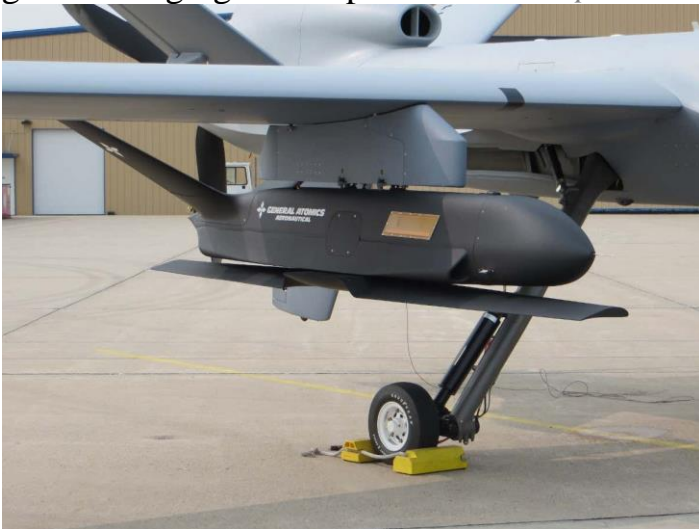
A picture of Sparrowhawk that General Atomics released to The War Zone shows that the drone features a large main wing that is stowed parallel with the main fuselage before launch, after which it swings 90 degrees into a deployed position. The drone also has a v-tail and there appears to be at least one air intake for the propulsion system on the right side. It's unclear what type of powerplant powers the air-launched drone.

This low-cost unmanned demonstrator could give larger drones, such as the MQ-9 Reaper, game-changing new capabilities. Joseph Trevithick The War Zone September 25, 2020