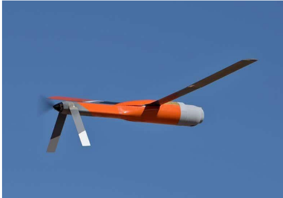
An ALTIUS 600. US ARMY

ability to gather information and then rapidly analyze and disseminate it, including targeting data that can then be passed to other U.S. military units in the air, on the ground, and at sea. As the name implies, attritableONE is focused on developing new attritable unmanned aircraft. In a recent major demonstration of various ABMS capabilities and associated technologies, an MQ-1C Gray Eagle launched an Area-I Air-Launched, Tube-Integrated, Unmanned System 600 (ALTIUS 600) small drone, acting as an attritableONE testbed. The ALTIUS 600 then positively identified a target that the MQ-1C's onboard sensors had first identified.