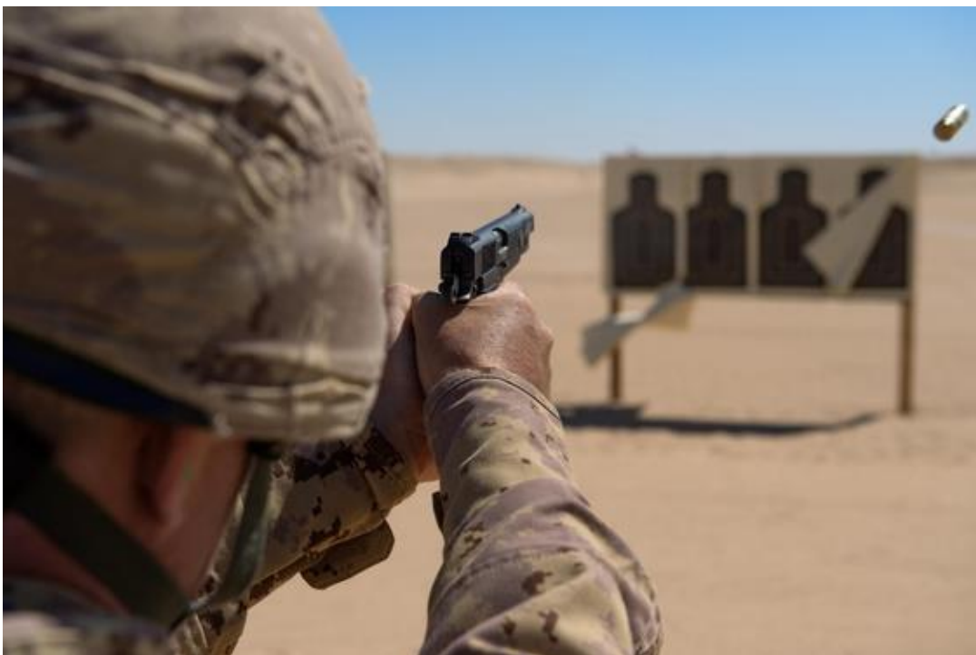
A Canadian Forces member fires his Browning 9mm pistol at a range in Afghanistan.