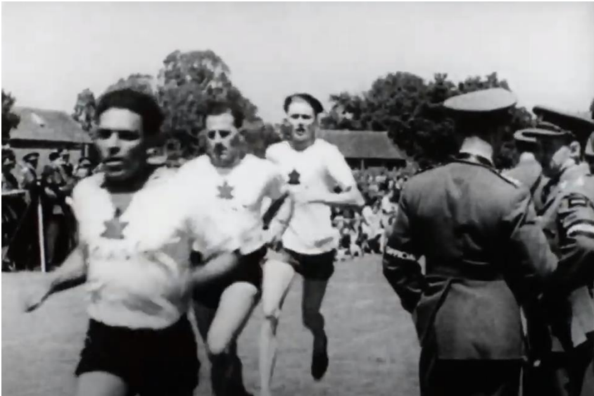
Members of the Royal Canadian Army Service Corps participate in a one-mile race as part of a wider I Canadian Corps sports meet in the United Kingdom, 1943 (Canadian Army Newsreel No. 12).