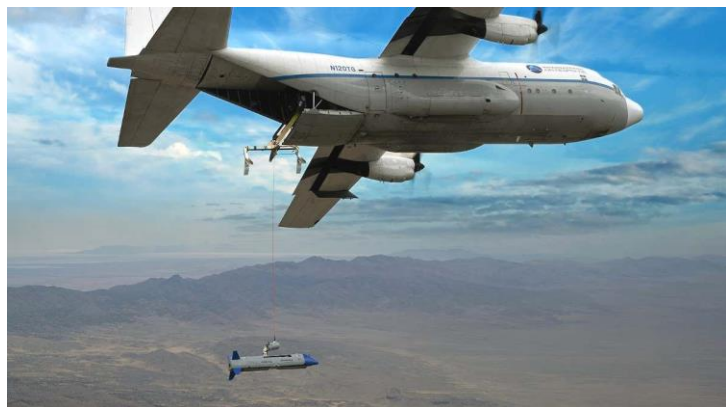
A X-61A Gremlins drone about to be reeled onto a C-130 Hercules during a flight test.