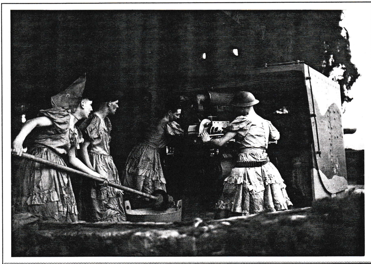
Gunners of a Coastal Battery somewhere in England, December 1941, were rehearsing a Charity Christmas Show when the alarm went. They had to run to man the Guns. British Authorities censored this photo.