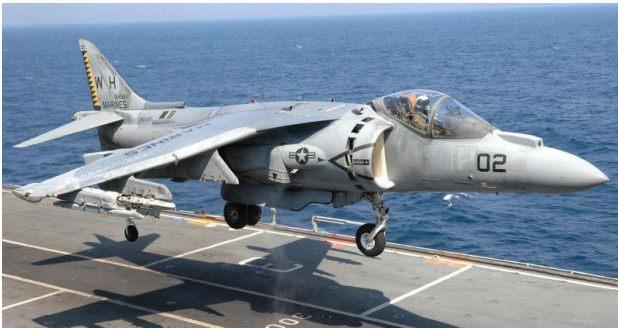
AV-8B Harrier of the USMC landing on Illustrious in 2007.