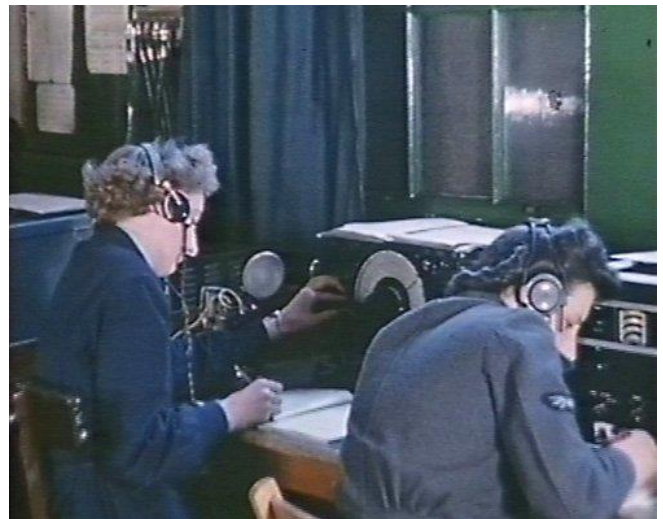
WAAF Corona System Radio Operators: "German-speaking WAAF radio operators in England eavesdrop on German frequencies." The Corona system was where WAAF operators would eavesdrop on Luftwaffe night-fighter frequencies and attempt to countermand their orders to cause confusion.

the spotlight upon men. There were women in the limelight, too, women of outstanding devotion and courage.