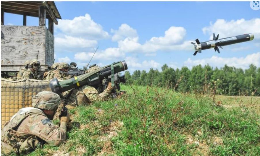
The FGM-148 Javelin anti-tank missile is a favorite of Ukrainian troops fighting Russian armor.

Guard Bureau State Partnership Program. According to the National Guard, the State Partnership Program includes 85 partnerships with 93 nations around the globe. The program enables Guard members to travel to partner nations and conduct military-to-military engagements in support of defense security goals. Moreover, it allows soldiers to create personal bonds that they can call on in the future. In the case of one Ukrainian soldier, this bond was lifesaving.