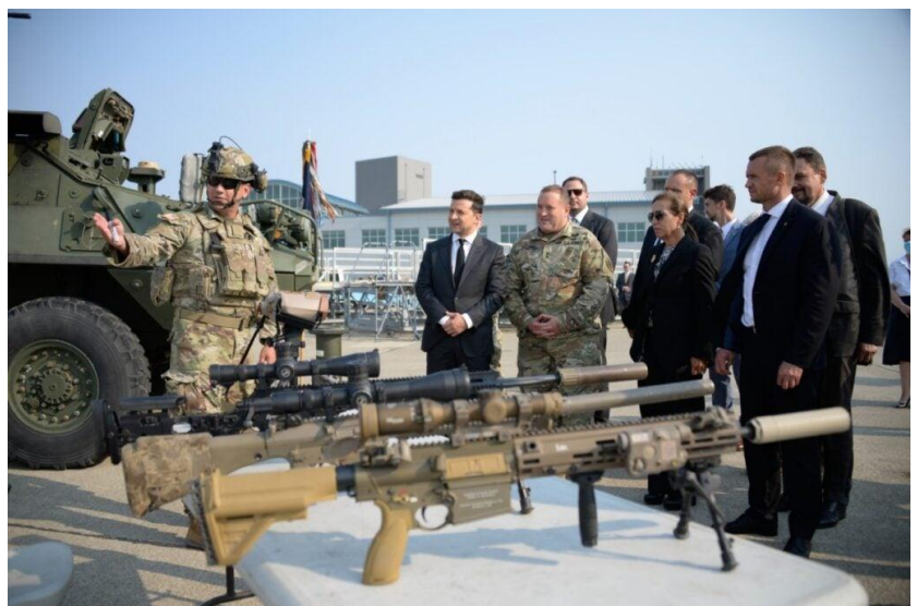
Ukrainian President Volodymyr Zelensky attends a tactical equipment demonstration at Moffett Air National Guard Base, California, Sept 2, 2021

The California National Guard, which has partnered with Ukraine under the SPP since 1993, also sent 4,320 ballistic vests, 1,580 helmets, and seven 50-bed field hospitals to Ukraine. California Guard members also sent personalized care packages to their Ukrainian allies. “California’s National Guard has formed an unbreakable bond with our