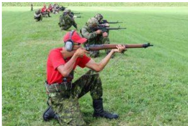
Canadian Rangers on Range