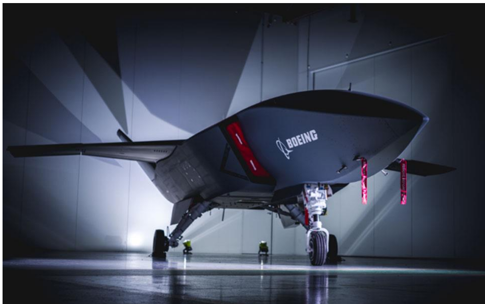
ATS Loyal Wingman Boeing