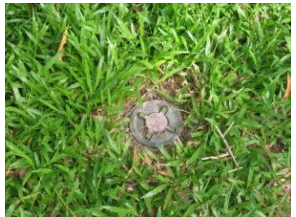
An anti-personnel mine in Cambodia.

Croatia, which has an estimated 264 square kilometers of minefields, containing 90,000 landmines, has taken a different approach and trains bees to associate the smell of explosives with food. To train the bees, scientists set up a test with a beehive at one end. Dotted around the tent are containers with similar containers. Only a few of the boxes hold a sugar-solution in them, and those are situated above ground impregnated with the smell of explosives. Gradually the bees learn to associate the scent of explosives with food. Once released in a minefield, the bees will make straight for a place where they smell explosives, expecting to find a sugar solution. Scientists working on the project claim that the bees are faster and safer than using sniffer dogs.