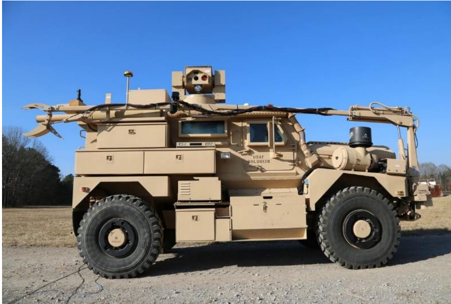
Redstone Test Center

Craig Bowman War History Online Oct 20, 2020