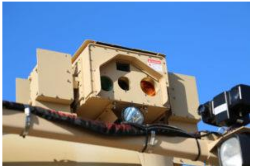
The ZEUS Laser System mounted on top of the vehicle.

The US Air Force is working with a company based in Virginia, Parsons Corporation, to build a vehicle that will have the capability to detonate landmines from just under 1000 feet