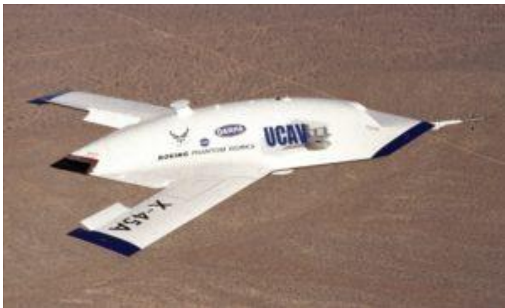
The Boeing X-45 technology demonstrator, an autonomous unmanned aerial vehicle.

It is apparent that the Observe and Orient steps are the heart-and-soul of any dogfight. Without knowing where the bandit is and what he is doing with his plane, it is impossible to determine where to shoot. Current technology cannot come close to the human ability to see and process those details quickly, to make a plan to attack. Technology will inevitably march on, and sensors that can “see” will be developed. When that day comes, the days of manned jet fighters may well be numbered. Even then, it is unlikely that these sensors will ever provide the perfect information that the simulator fed the AI system to defeat Banger.