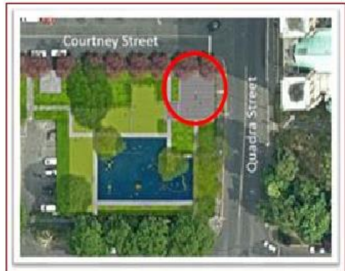
Corner of Quadra and Courtney Streets