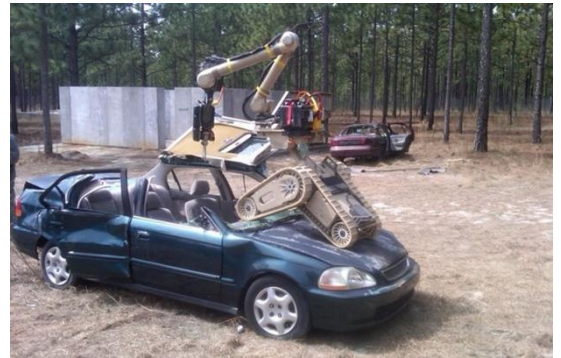
CRS-H makes new friends during field testing

More importantly, according to the service, "a phased, quicker acquisition plan allowed the Army to make informed program decisions based on direct Soldier feedback on commercially available technology — fielding equipment faster than typical processes allow." Translation: the Army was able to whip up this bad boy more rapidly than other acquisition projects and with increased feedback from the soldiers who will actually operate the thing downrange. "We develop equipment for Soldiers to use in demanding situations, and there is no substitute for their perspective in operating the system - their input is of utmost value," Maj James Alfaro, chief EOD capability developer at the Army's Sustainment Capability Development and Integration Directorate at Fort Leonard Wood in Missouri, said in an Army release.