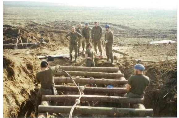
Canadian pioneers build a bunker in Croatia in 1992.

Bearded assault pioneers served with the Canadian Armed Forces in Afghanistan, but in the post-Cold War era, army planners eventually deemed the job redundant and not cost-efficient, so the pioneers were disbanded, and their tasks handed off to combat