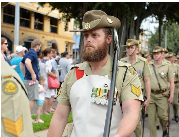
An Australian pioneer sergeant with a leather apron and axe.

An age-old military tradition has returned to the Canadian Army just a few years after it was abandoned. Assault pioneers—long-known as the bearded, leather-aproned, axe-bearing innovators whose jobs originated with the Roman legions—are making a comeback, albeit with some modern twists. Attached to infantry units, they have typically been responsible for manual labour and light engineering work such as road-clearing (hence, the axe) and specialized explosives work, making way for assault troops to proceed with their lethal tasks. Usually about 10 men strong, they are the MacGyvers of the infantry units, coming up with