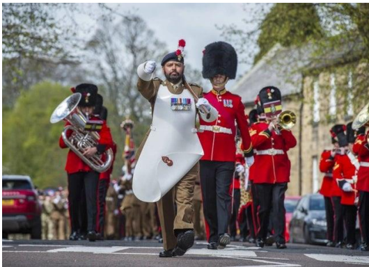
A pioneer sergeant leads The Royal Regiment of Fusiliers during a Saint George's Day parade in Alnwick, England, on April 27, 2019.