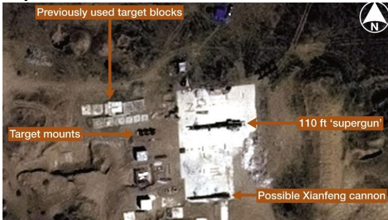
Astrium imagery dated 19 July 2013 shows two objects under testing at an armour and artillery test complex near Baotou, China.

The two pieces, which are horizontally mounted, are mounted on a concrete pad that appeared between September 2010 and December 2011, when the two pieces were first captured by satellite imagery. Images provided by Astrium confirmed that the objects were still in place in July 2013.