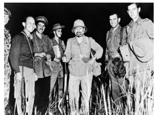
Chindit leaders Burma 1944. General Orde Wingate (centre) with other officers at the airfield code-named “Broadway” in Burma awaiting a night supply drop.

Gideon Force, made up of British, Ethiopian and Sudanese soldiers, soon ran the Italians ragged, and in a war that they were ill-equipped to fight, forced the Italian forces of 20,000 men to surrender to their 2,000 in 1941. Emperor Haile Selassie was another of the men who looked upon Wingate with affection and favour. The Emperor of Abyssinia