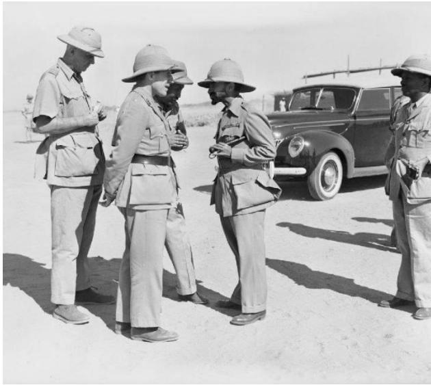
Wingate, ‘Gideon Force’ Commander, talking with the Emperor Haile Selassie of Abyssinia.

Finally, however, Wingate made a public speech in which he called for the establishment of a Jewish state, which caused his dismissal. However, the speech and his leadership gained him the everlasting gratitude of the future Israelis, especially the famed general Moshe Dayan. Today, a square in Jerusalem, a national forest, a youth village and many streets in Israel are named after him. Back in England for the outbreak of WWII, he was soon posted to Ethiopia to organize a guerrilla force around the Ethiopian emperor, Haile Selassie, whose country had been conquered by the Italians in 1936-37. This force, known as the “Gideon Force” was made up of officers who shared Wingate’s vision for irregular troops and who had fought with him in Palestine. Wingate, like many “different” officers throughout history, inspired either complete disdain or complete loyalty, and many of those loyal to him followed him to Ethiopia and beyond.