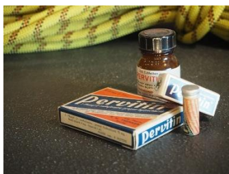
Pervitin in various dosage forms from high mountain expedition equipment in the exhibition of the Messner Mountain Museum Coronas

The Third Reich, a nation built on drugs. This title reaches all the way up to the upper echelons of the Nazi hierarchy. We all know that the Reichsmarschall and the head of the Luftwaffe, Herman Goering, was addicted to morphine. But what about the Führer himself? If historical sources are anything to go by, Adolf Hitler consumed large quantities of a special drug that kept him going despite fatigue. No wonder the man could shout for hours on end. And, as always, the self-acclaimed munificent Führer shared his wisdom and bounty. What was good for Hitler was good for his troops. As a result, he