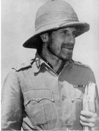
British Army General Orde Charles Wingate

disheveled looks and bad body odor, alienated more than a few of his commanders and colleagues. He would also occasionally greet visitors to his tent completely naked. His father was a retired officer and member of the Plymouth Brethren, a conservative Christian group, which among other things, emphasized the Bible as the root of all truth. Much of Wingate's childhood was spent with his siblings learning the Bible. As a result of a somewhat isolated childhood, Wingate developed into a loner who seemed to alienate people wherever he went. His father championed at giving his children difficult problems to solve and encouraged them to "think out of the box". This, and the study of men such as Lawrence of Arabia, whose unorthodox tactics kept the Ottoman Empire on the run in the desert, fostered Wingate's later ideas about irregular warfare.