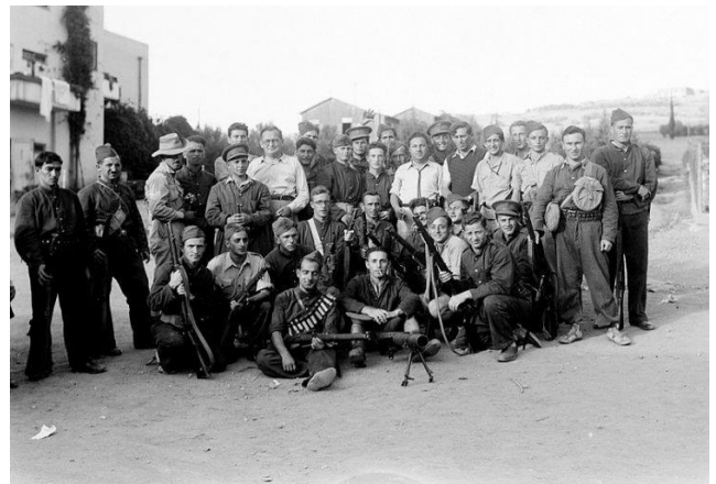
Members of the Special Night Squads, formed under the command of Capt Charles Orde Wingate, consisting of 75 "Hagana" members.