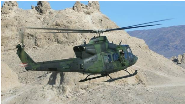
The crash involved a CH-146 Griffon helicopter.

flight crews, who usually did exercises before and during their deployment to Afghanistan. However, "the vast majority of the [Canada Helicopter Force, Afghanistan] aircrew only received the theory portion of the dust ball training," the board of inquiry report said. Some pilots only got to watch the manoeuvre, not attempt it. In this specific case, prior to his deployment "the [pilot] only observed a demonstration of the landing technique rather than practised dust ball landings himself," the flight safety report said. "Additionally, the [pilot] did not observe or complete any dust ball takeoff techniques." Put simply, the pilot blamed for crashing the helicopter was allegedly sent to Afghanistan lacking the training to take off and land in sand.