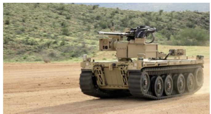
Pratt & Miller Expeditionary Modular Autonomous vehicle (EMAV)

The vehicle features a typical track configuration with a rubber track band and can reach speeds of up to 72 km/h. The vehicle's curb weight of 3.08 tonnes and payload capacity of up to 7,000 lb (3,175 kg) will allow it to compete in two categories of the NGCV programme: RCV Light and RCV Medium. Pratt & Miller is also demonstrating its wheeled variant – the Trackless Moving Target Vehicle - in the RCV Light category. The EMAV is claimed by Pratt & Miller