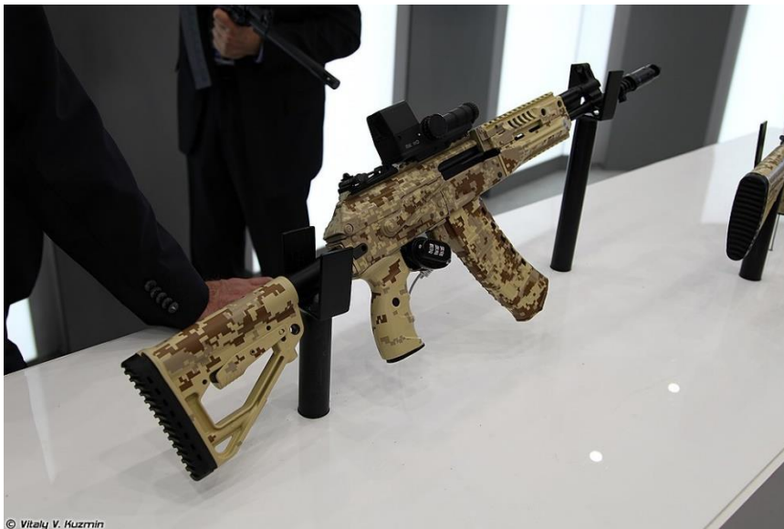
A right-side view of the AK-12 5.45×39mm assault rifle