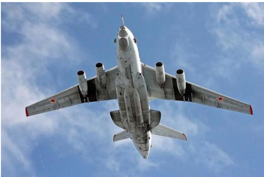
A Russian air force Beriev A-50.