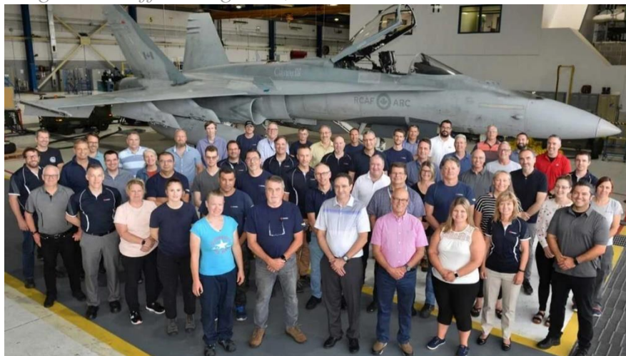
The L3Harris team in Mirabel, Canada, June 2023

The initial fighter aircraft of the Hornet Extension Project (HEP) were delivered by L3Harris in June 2023. The aircraft were made ready at the L3Harris Canadian fighter aircraft centre of excellence located