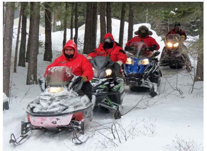
So-called "go teams" of six to eight Canadian Rangers are ready to react and deploy immediately to communities without their presence.