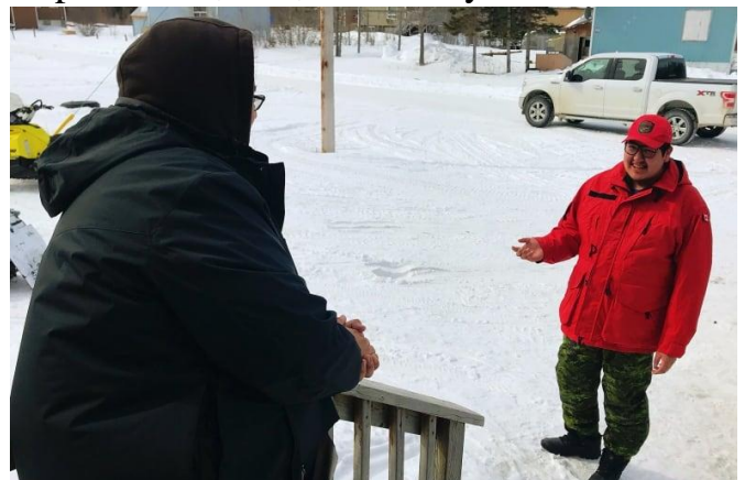
Canadian Rangers will be going house-to-house conducting wellness checks to make sure people have what they need during the pandemic.