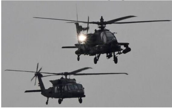
Black Hawk (L) and Apache (R) helicopters, two of the main types in use by the US Army today

David Axe The Telegraph 14 February 2024