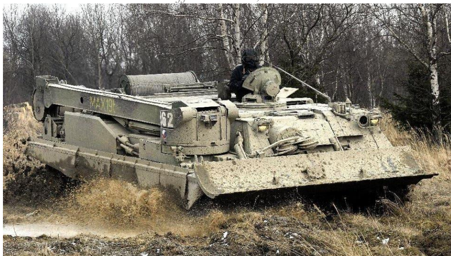
A Czech army VT-72B.

The VT-72B is an oddity: an armored engineering vehicle based on a T-72 tank, minus its turret and gun, and briefly manufactured in the former Czechoslovakia in the late 1980s and early 1990s. East Germany acquired a few copies, as did India, but for the most part the VT-72B was Czech —until Czechoslovakia split up in 1993 and the ARVs cascaded to the successor states: the Czech Republic and Slovakia. Neither country’s army still has any of the 46-ton, two-crew engineering