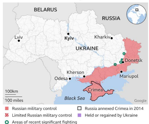
Areas of Russian military control in Ukraine