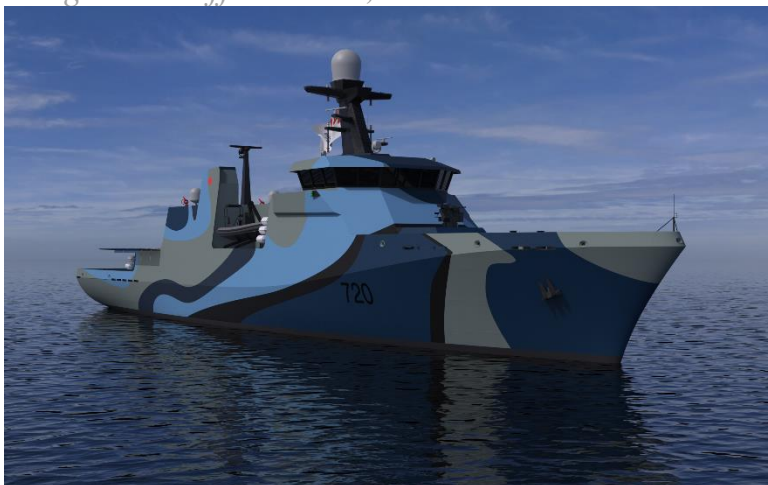
VARD Vigilance Offshore Patrol Vessel

Vard Marine Inc., a subsidiary of Fincantieri, unveiled the Vigilance Offshore Patrol Vessel (OPV) at CANSEC 2023 in partnership with Heddle Shipyards, Thales Canada, SH Defense, and Fincantieri S.p.A., forming the