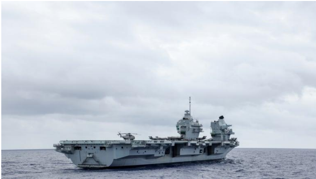
HMS Queen Elizabeth at sea on Sept 9, 2021.

Murray Brewster · CBC News · Oct 09, 2021