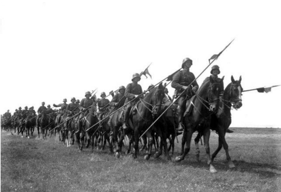
Pre-war German cavalry.

The notion that Polish Cavalry charged German tanks during the 1939 Invasion of Poland is one of the Second World War's most enduring myths. It stems from an engagement near the Polish village of Krojanty on the first day of the campaign in which Polish cavalymen were ambushed by German armoured vehicles, resulting in heavy casualties. Foreign war correspondents on the scene were told by German officials that the horsemen had foolishly charged the vehicles. The story quickly spread across the globe. Joseph Goebbels' propaganda machine also seized upon the image of backward Polish cavalry suicidally attacking German Panzers as an exemplification of the Wehrmacht's technological invincibility. Although the vast majority of the Polish cavalry battles during the 1939 Campaign were fought by dismounted riders, charges did occur with varying degrees of success. They would continue to be conducted throughout the war on other fronts by other armies. The last American charge was conducted by the 16 th Cavalry Regiment in January of 1942 in the Philippines, and perhaps the last major charge ever was carried out by the Italian Savoia Cavalleria regiment that same year in the Soviet Union.