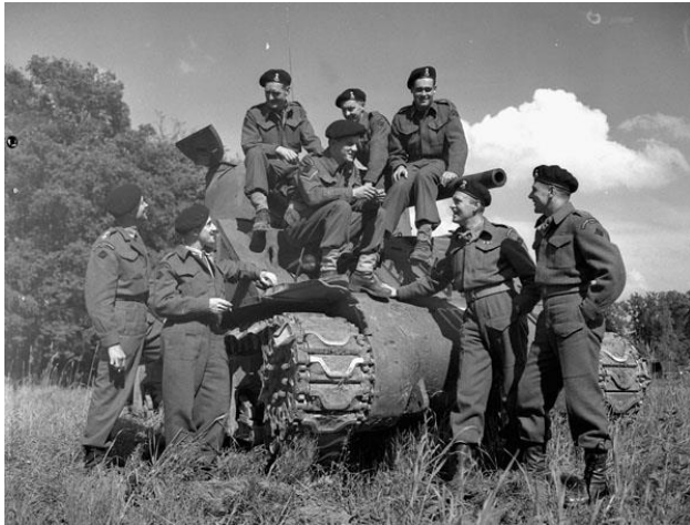
Crewmembers and officers who served on the 'Bomb' pose with it on Jun. 8, 1945 in the Netherlands.

The 14,000 Canadians and 200 tanks that landed at Juno Beach on June 6, 1944 fought bitterly to breach Fortress Europe and begin the long march to Berlin. Almost a year later Canada and the rest of the Allied powers celebrated the fall of Nazi Germany.