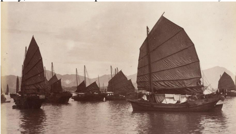
Lai Afong, Public domain, via Wikimedia Commons.

American and Chinese forces engaged in old-fashioned naval combat, complete with a boarding party, to take out a Japanese vessel. Nicholas Slayton Task & Purpose Aug 6, 2022