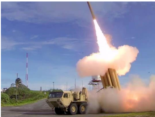
A THAAD battery fires an interceptor.

Could the US stop a North Korean nuclear attack? It's complicated. The US and its allies have three major forms of missile defense against North Korea. "Missiles come in a variety of ranges," Lewis said. "Every missile defense system is set to deal with a small subset of missiles in a particular range and at one stage in flight." For the short- and medium-range missiles with which North Korea could look to strike a nearby foe — or the 25,000 US troops stationed in South Korea — the US has Aegis radar-equipped Navy destroyers. "That's good for medium-range missiles," Lewis said. Next, Patriot Advanced Capability-3 interceptors defend against missiles at their final, or terminal, stage. These are "mostly good at short- and medium-range ballistic missiles," said Lewis. The PAC-3 "would cover a city or an airfield," he added. Finally, the biggest and perhaps best system is the Terminal High-Altitude Area Defense system. "THAAD could cover all of South Korea, including everything up to a Nodong missile," North Korea's medium-range system, Lewis said.