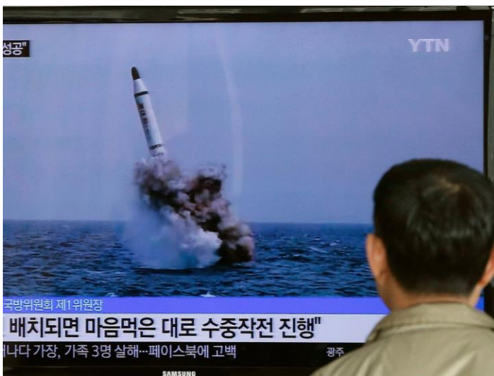
A South Korean man watches a TV news program showing an image published in North Korea's Rodong Sinmun newspaper of North Korea's ballistic missile believed to have been launched from underwater.