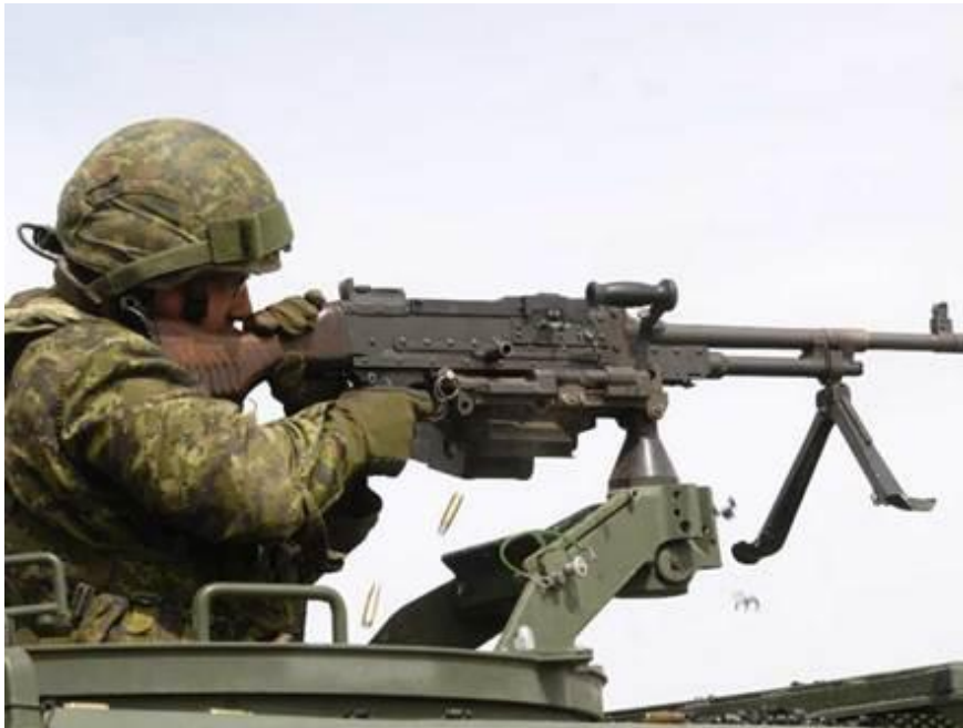
A Canadian Army reservist fires his machine-gun during exercises in 2009 at CFB Suffield, Alberta.