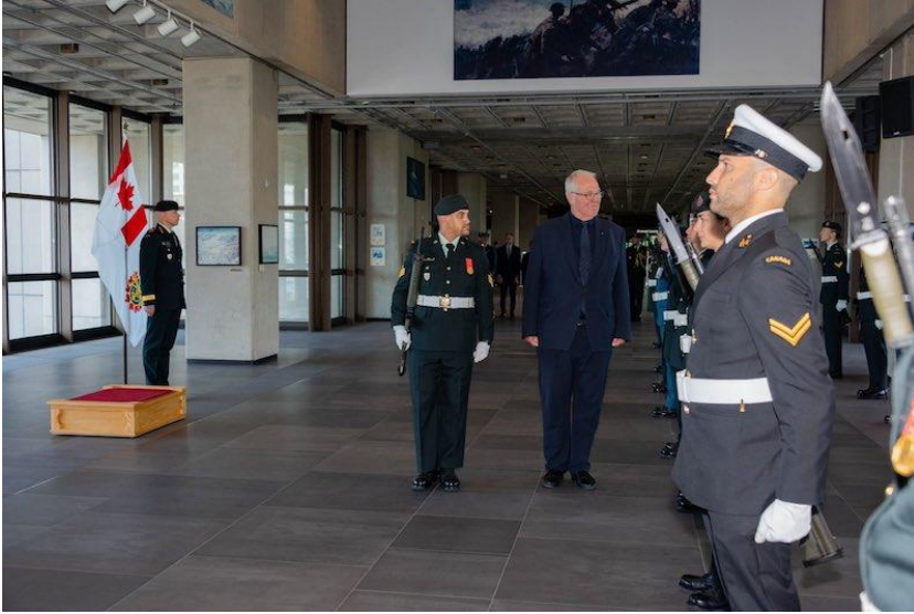
Minister of National Defence visiting National Defence Headquarters on August 1, 2023.

The Minister of National Defence introduced legislation in an effort to modernize the military justice system and advance cultural change. Canadian Military Family Magazine April 2024