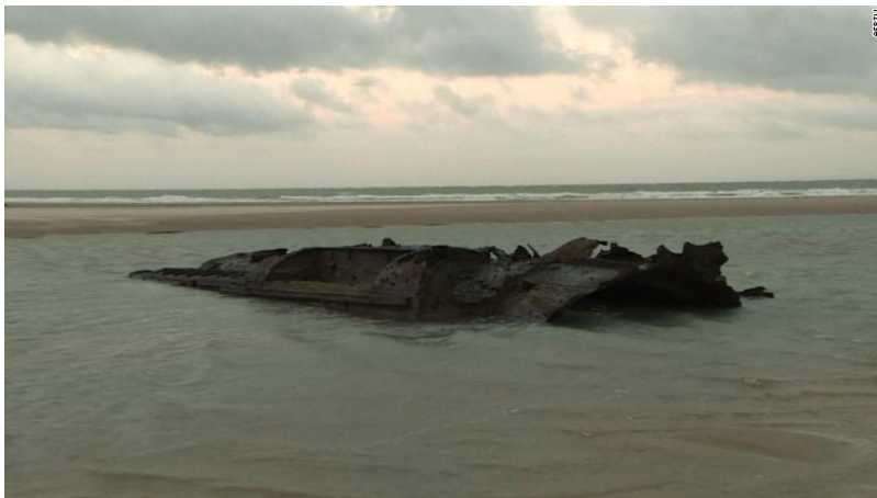
The metal frame of the German U-boat UC 61 is visible during low tide in Wissant, France."

Though the vessel is categorized as a coastal mine-laying sub, it did have deck guns and carried torpedoes. UC 61 is credited with sinking or damaging more than a dozen ships between November 1916 and July 1917, archives show. On